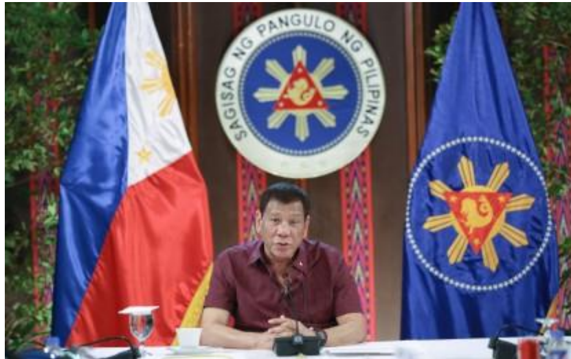
President Rodrigo R. Duterte

MANILA – President Rodrigo Duterte enjoined Muslim Filipinos to be “living examples” of Islamic faith as the world celebrates Eid’l Fitr while grappling with the coronavirus disease 2019 (Covid-19) health crisis.