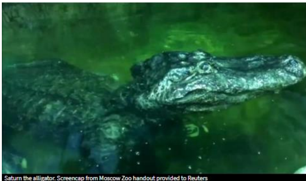
Saturn the alligator.

MOSCOW — An alligator that survived a bombing raid on the Berlin zoo in 1943 and ended up east of the iron curtain after World War II has died of old age at 84, the Moscow Zoo said.