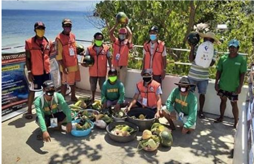
Bantay Dagat volunteers from Barangay Pili in Oriental Mindoro excitedly hold up food from the MFI package.

Along the coasts of Northern Palawan, Oriental Mindoro, and Batangas City, where Malampaya Foundation Inc. (MFI) forged community-based marine biodiversity conservation partnerships, deputized volunteer sea rangers or “bantay-dagat” continue their enforcement duties to protect natural coastal resources despite the difficult circumstances brought on by the COVID-19 lockdown.