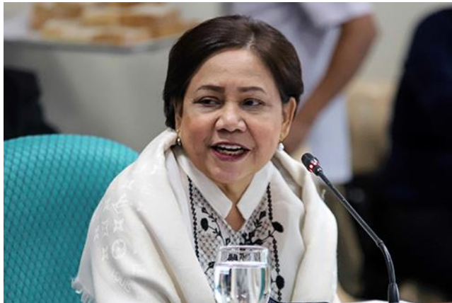
Sen. Cynthia Villar

https://news.mb.com.ph/2020/05/08/a-cleaner-environment-must-be-part-of-new-normal-villar/