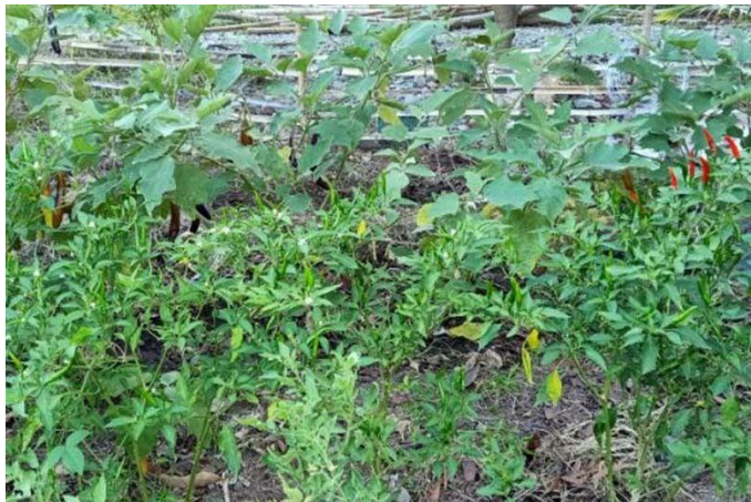
A backyard garden in Lupao, Nueva Ecija. Tresalin Cabico

https://www.philstar.com/business/agriculture/2020/05/08/2012553/community-gardens-can-help-feed-people-post-pandemic