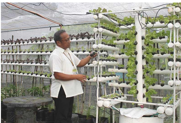
A vertical garden in Central Luzon State University.

"If you have one square meter, you can grow about 400 leafy vegetables layer by layer. If you plant on land, you can only fit around 25 leafy vegetables in the same area. Vertical gardening can increase production," the agriculturist said.