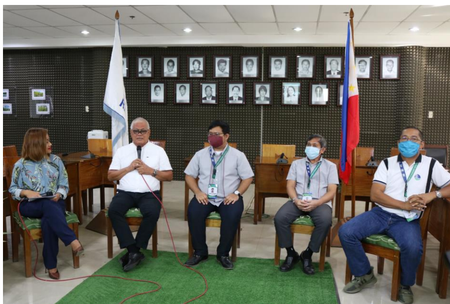
Talakayan sa PIA with DENR.

They have given a total of 4,234.67 bd.ft lumber in Bukidnon, 3,611.46 in Misamis Oriental and 8,089 bd.ft in Misamis Occidental; totalling to 15, 933.13 bd.ft was given as donations to the LGUs.