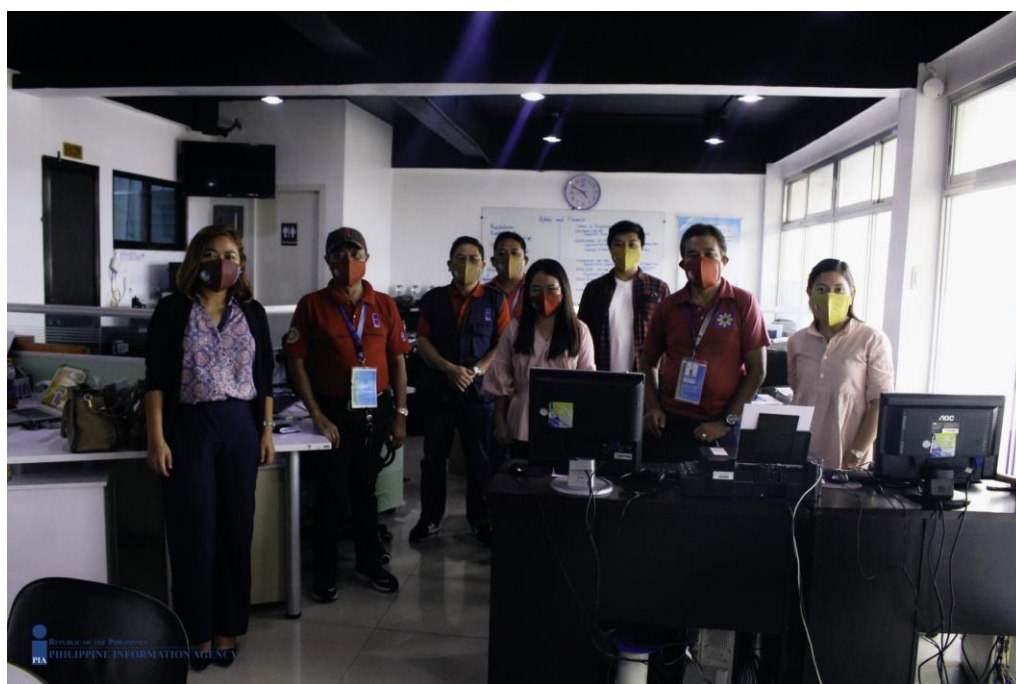
Philippine Information Agency (PIA)-10 staff wear eco-friendly masks provided by DENR to frontliners.

This eco-friendly mask is produced by the Salay Handmade Paper Industries, made from sustainable materials of strong fiber and grass manufactured and converted into special filters.