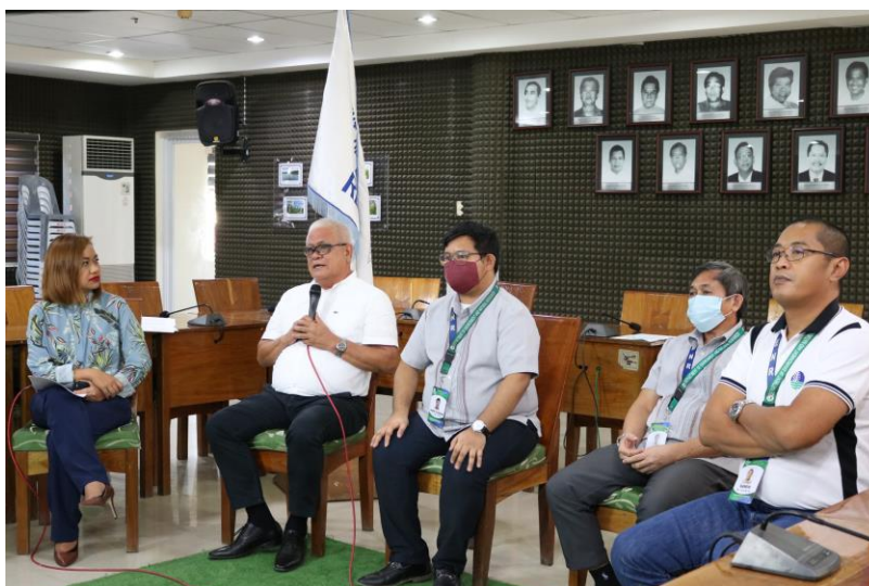
Department of Environment and Natural Resources (DENR)-10 shares their initiatives amid COVID-19 pandemic during Talakayan sa PIA on April 27, 2020.