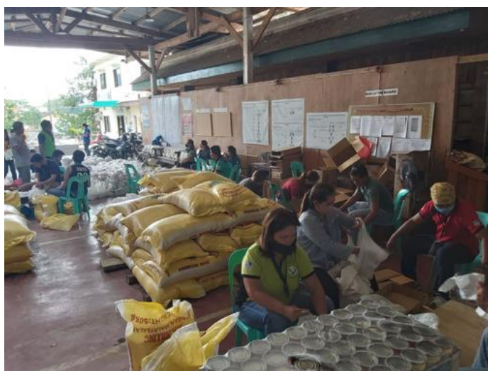
DENR employees repack goods for donation. (DENR10)

They also distributed relief goods to the 75 families of senior citizens, 4Ps Beneficiaries, Barangay Patrol and Health Workers in barangays located at Oroquieta City. Aside from the 50 love packs (relief goods) given to 40 PENRO Misamis Occidental Job Orders, 4 dismissed employees and 6 garbage collectors.