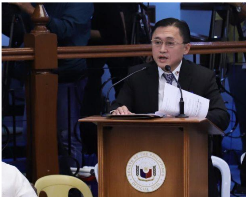
Sen. Bong Go. FILE PHOTO

MANILA, Philippines — Senator Christopher Lawrence “Bong” Go called on the national government and local government units to continue upholding the rights and promoting the welfare of Filipino workers as the country commemorates Labor Day on the first day of May.