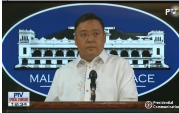
Presidential Spokesperson Harry Roque