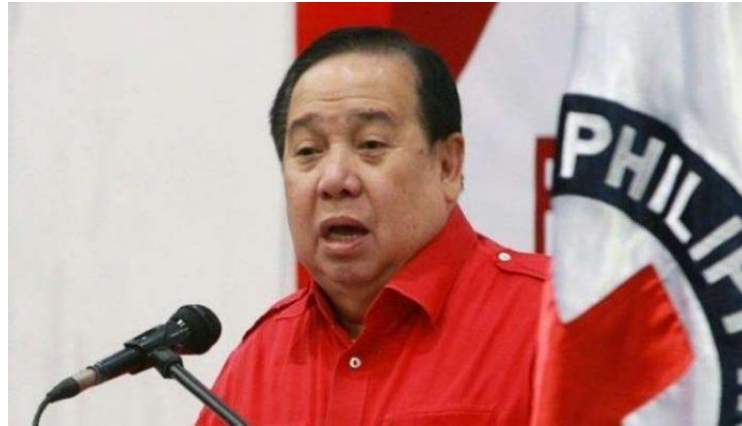
Senator Richard Gordon is also Chairman of the Philippine Red Cross

A BILL seeking the creation of the Philippine Center for Disease Control and Prevention has been filed by Sen. Richard Gordon who said government needs to be prepared for health threats.