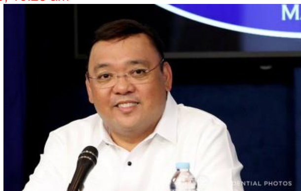
Presidential Spokesperson Harry Roque. (File photo)

By Azer Parrocha April 29, 2020, 10:26 am