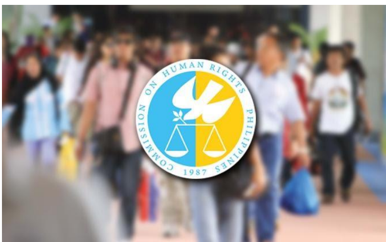
Commission on Human Rights (MANILA BULLETIN)

The Commission on Human Rights (CHR) believes that “systemic and individual changes” are needed in order to protect the environment and achieve climate justice.