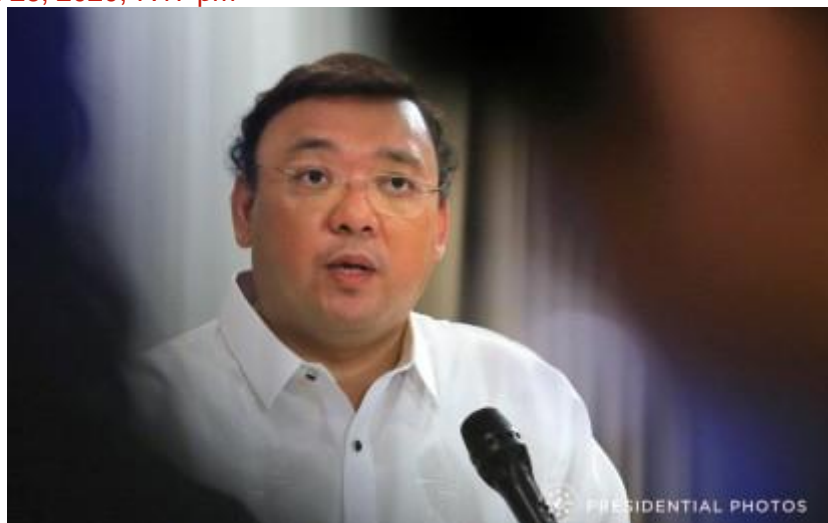
Presidential Spokesperson Harry Roque