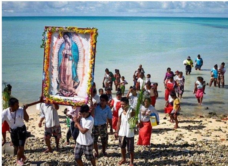
Will the country's colorful culture and traditions sink along with its low-lying atolls?