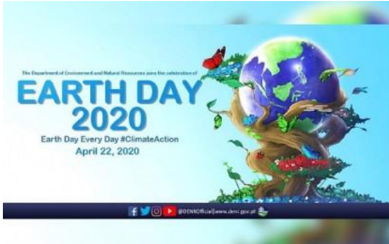
Image grabbed from DENR's Facebook page