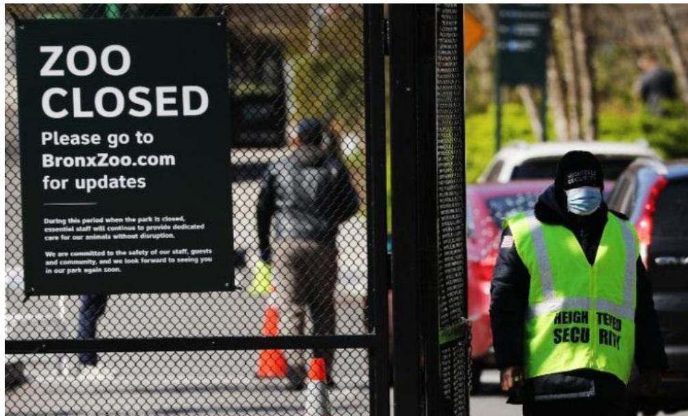
A guard stands at the entrance to the Bronx Zoo on April 6 in New York City.

(CNN) — Seven more big cats have coronavirus at the Bronx Zoo, in addition to a tiger that tested positive earlier this month, the Wildlife Conservation Society announced.