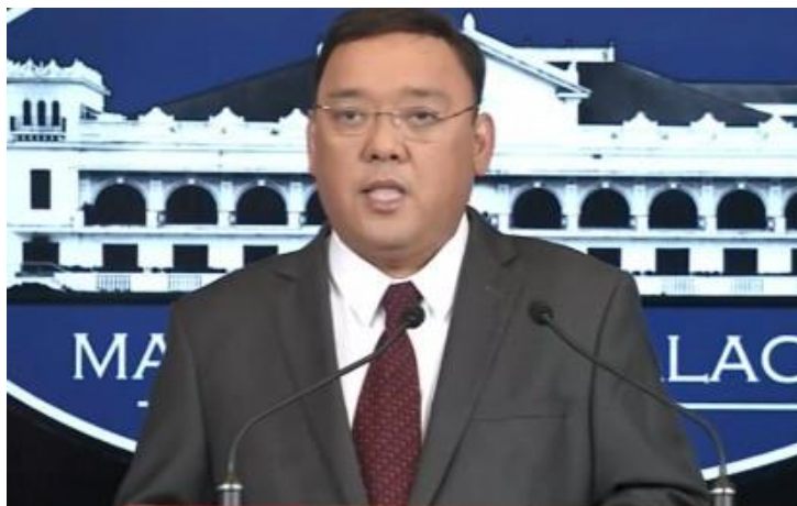
Presidential Spokesperson Harry Roque ( File photo )

By Azer Parrocha April 23, 2020, 10:56 pm