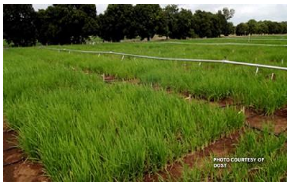
An irrigated farmland in Bulacan. (File photo)

CITY OF MALOLOS, Bulacan – The National Water Resources Board (NWRB) will allocate irrigation water to the National Irrigation Administration's (NIA) south zone service areas in this province starting in June.