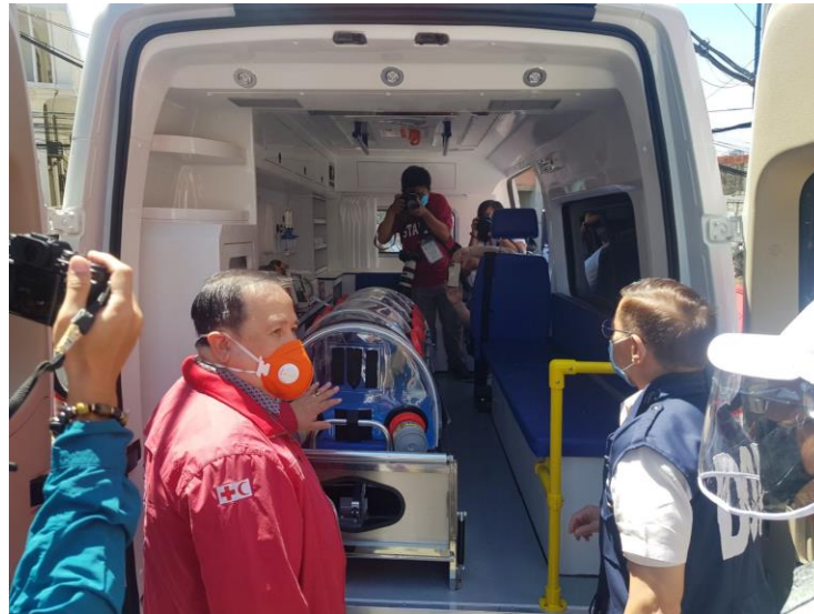
Health Secretary Francisco Duque (L) checks on the tests kits of the Philippine Red Cross.

Published 23 hours ago on April 23, 2020 09:42 AM By TDT