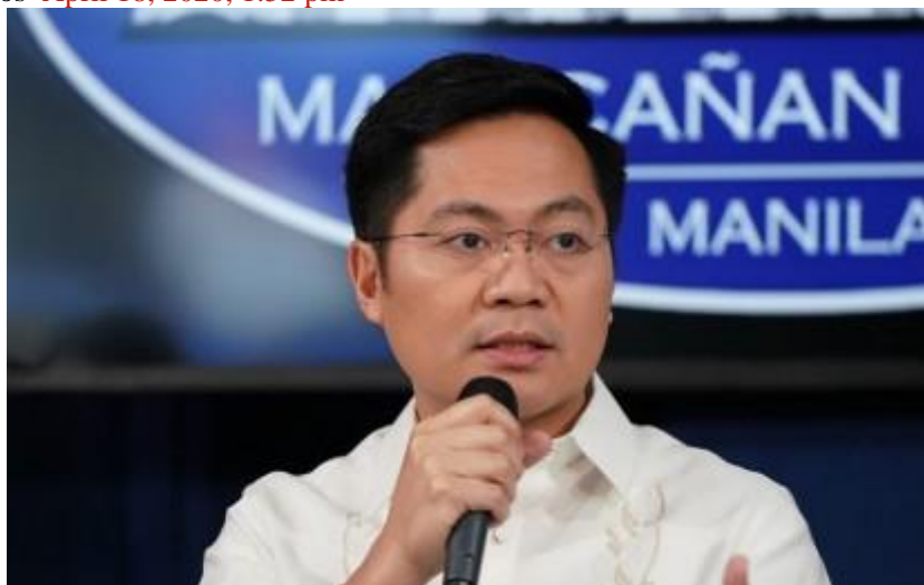
Cabinet Secretary Karlo Nograles