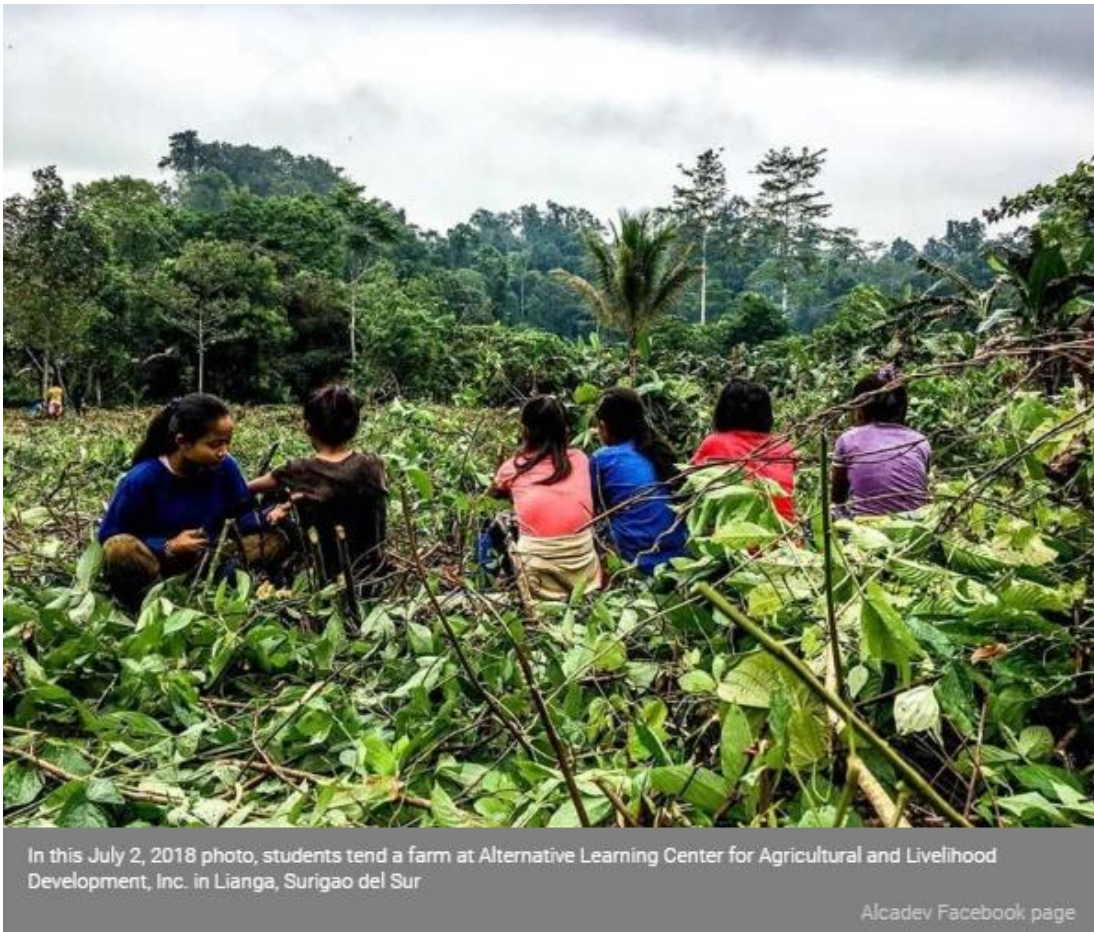
In this July 2, 2018 photo, students tend a farm at Alternative Learning Center for Agricultural and Livelihood Development, Inc. in Lianga, Surigao del Sur