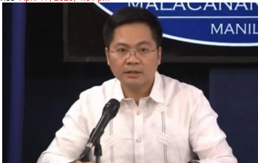
Cabinet Secretary Karlo Nograles