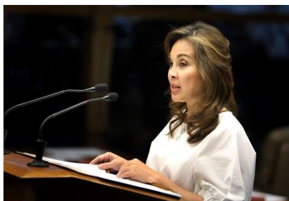
Antique Rep. Loren Legarda

Deputy Speaker and Antique lone district Rep. Loren Legarda asked on Thursday, April 16 households to minimize their carbon footprint by setting up food gardens, eating more vegetables, and reducing food waste.