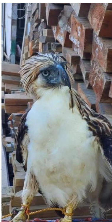
Philippine eagle rescued in Siocon, Zamboanga del Norte.

A Philippine Eagle was rescued and turned over to the Department of Environment and Natural Resources (DENR) Region IX thru the Community Environment and Natural Resources Office (CENRO) of Siocon, Zamboanga del Norte on Thursday.