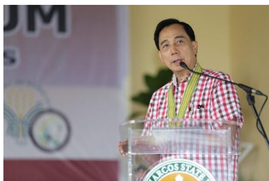
Department of Agriculture Secretary William Dar

The Department of Agriculture (DA) is eyeing the transformation of vast ancestral lands into food production areas as “practical” strategy to produce more food amid the coronavirus pandemic. DA Secretary William Dar asked the indigenous peoples (IPs) to help the government in transforming part of their idle ancestral lands into vegetable and high-value crop farms, which can provide immediate results during this time of crisis.