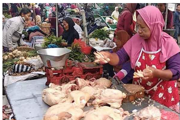
Wet market in Indonesia. IDN PHOTO

At the Wuhan wet market and in many such markets across China and Vietnam as well, numerous wild animals, including live wolf pups, salamanders, crocodiles, scorpions, rats, squirrels, foxes, civets and turtles are being sold for human consumption.