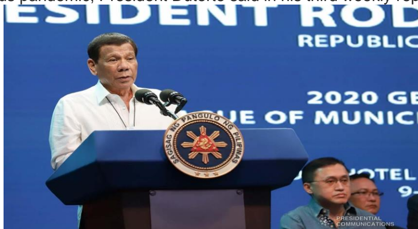
President Rodrigo Roa Duterte

The government has moved to ensure a stable supply of water, energy, and fuel as the country battles the coronavirus pandemic, President Duterte said in his third weekly report to Congress.