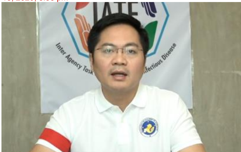
Cabinet Secretary Karlos Nograles

By Azer Parrocha April 13, 2020, 6:56 pm