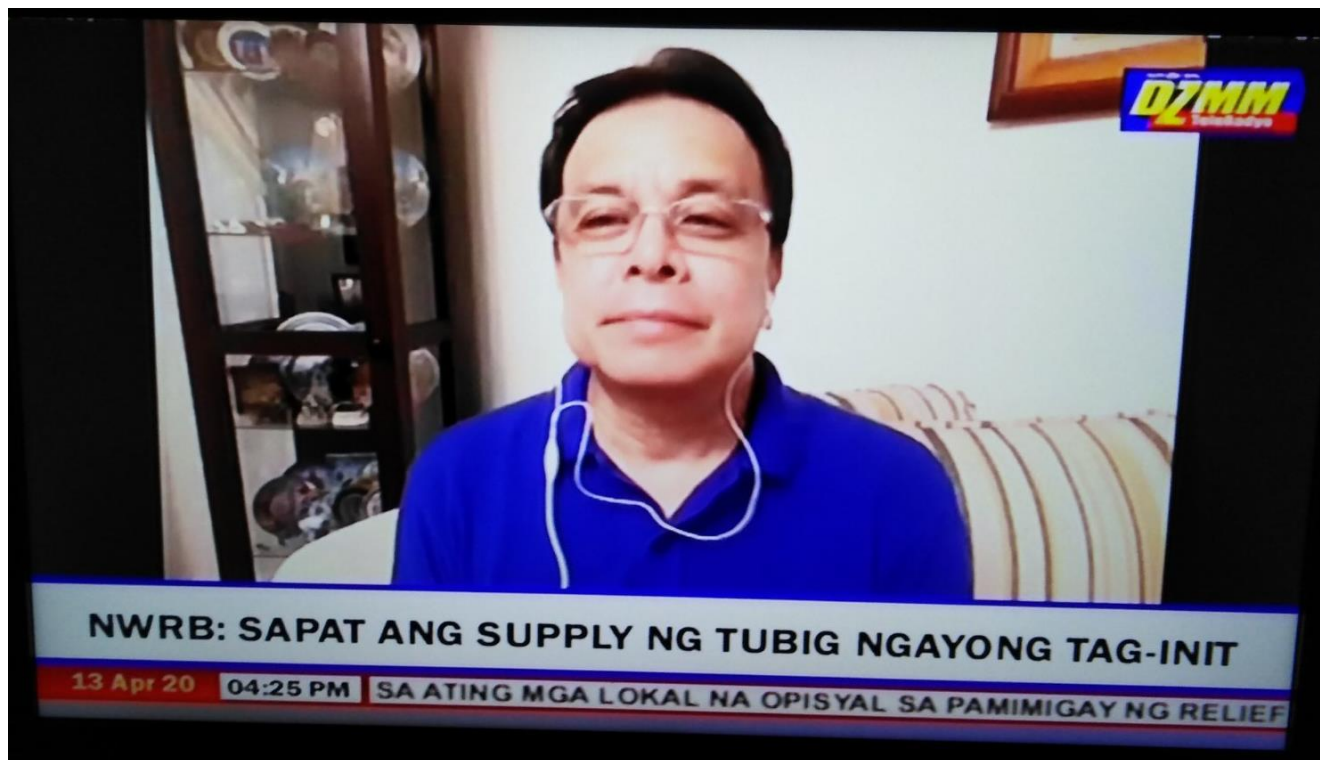
NWRB: Sapat ang Supply ng Tubig ngayong Tag-Init