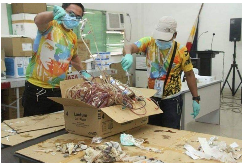
Medical waste is being inspected in this January 23, 2019 file photo. FILE PHOTO