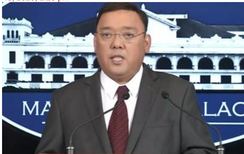
Human rights lawyer Harry Roque ( File photo )

By Azer Parrocha April 13, 2020, 2:25 pm