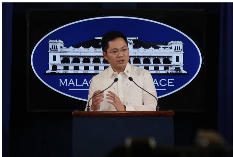
Cabinet Secretary Karlo Nograles

This was announced in the Monday virtual press briefing of Cabinet Secretary Karlo Nograles, spokesperson of the Inter-Agency Task force (IATF) for the Management of Emerging Infectious Diseases announced.