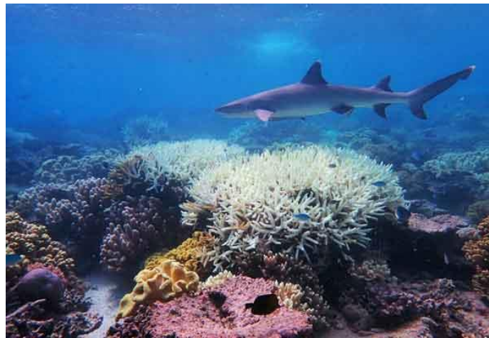
BAD TO WORST Australia’s Great Barrier Reef has suffered its most widespread coral bleaching on record, scientists say — a dire warning about the threat posed by climate change to the world’s largest living organism.