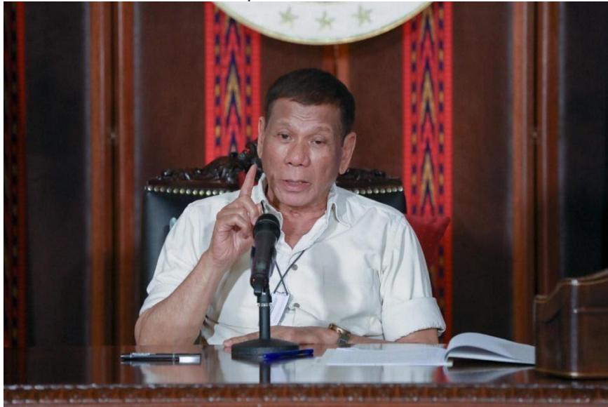
President Rodrigo Roa Duterte

President Duterte has raised the possibility of allowing reclamation projects in Manila Bay to raise revenues for the government’s efforts to address the COVID-19 pandemic.