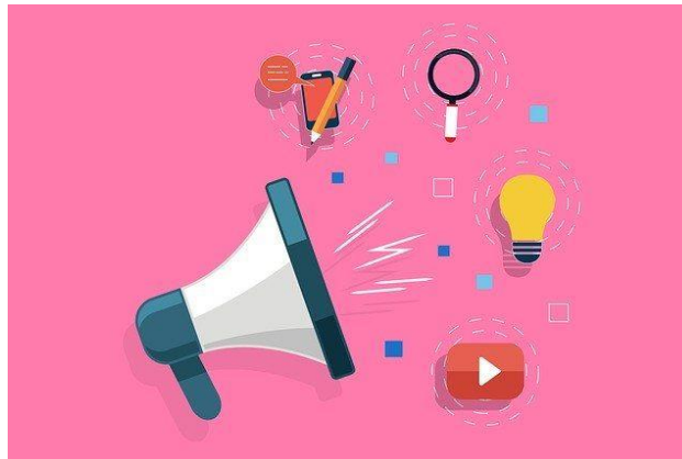
Digital illustration by Mudassar Iqbal from Pixaba

The Department of Environment and Natural Resources released a memorandum discouraging its employees from posting criticisms against the government's COVID-19 efforts on social media.