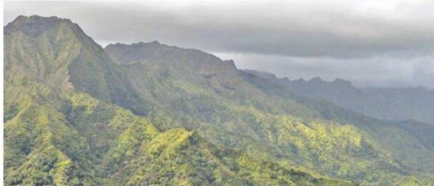
HAWAII'S landscape is largely volcanic.

studying volcanoes on land, I focus mostly on understanding how frequently events happen and what hazards people face. Up until maybe a thousand years ago, humans were much more tuned into their environment and tended to stay away from the most dangerous places like volcanic areas, but it's our modern mentality that we can tame anything. So, we encroach much more closely on very dangerous environments," he added.