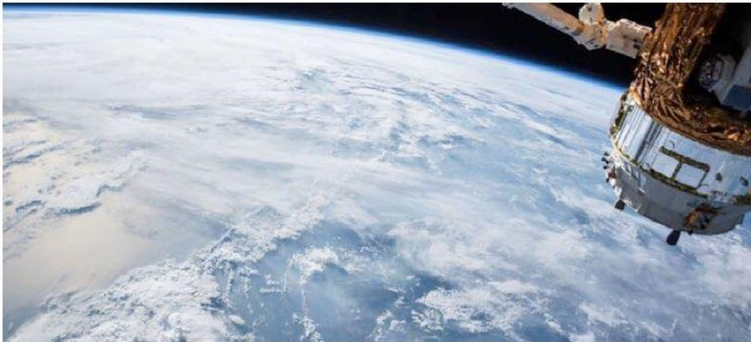
A SATELLITE — as seen from space — tracks over Earth.

He explained that the devastating impacts of climate change haven't stopped since the new coronavirus emerged in December, and neither have the "growing" number of weather-related disasters.