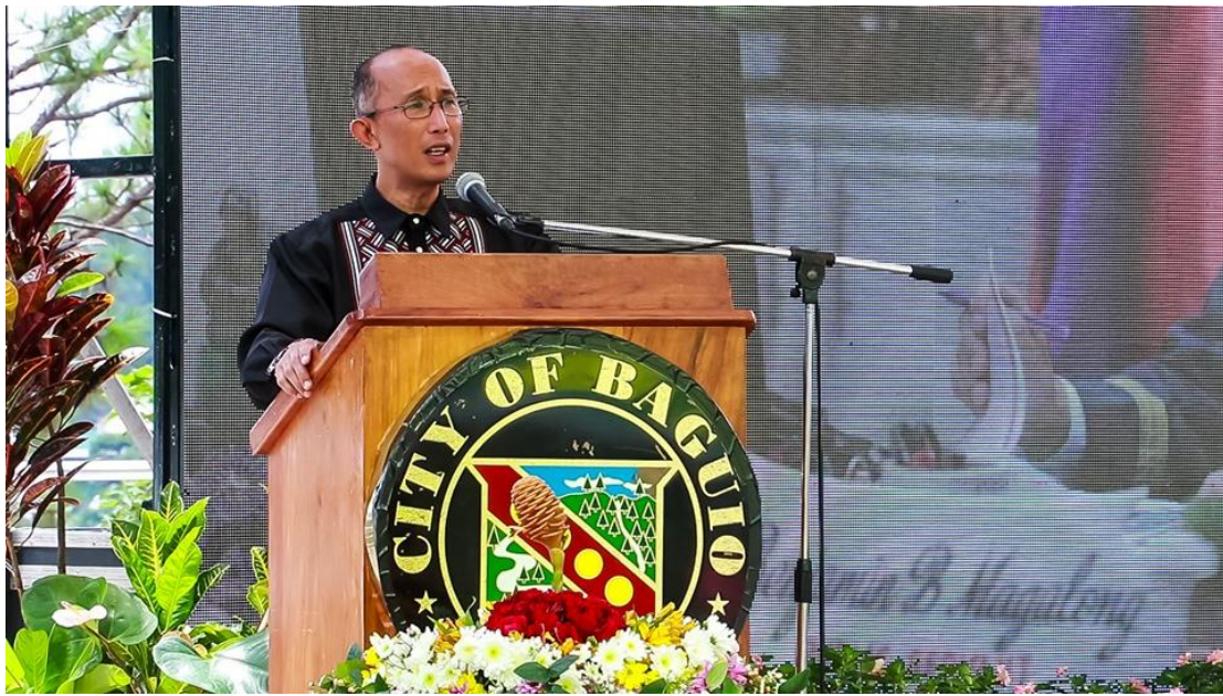
Baguio City Mayor Benjamin Magalong

BAGUIO CITY – Mayor Benjamin Magalong launched a “rat-catching challenge” on Wednesday at the Baguio City Public Market to address sanitation issues which, he emphasized, should be another key to prevent the spread of the coronavirus disease 2019 (COVID-19).