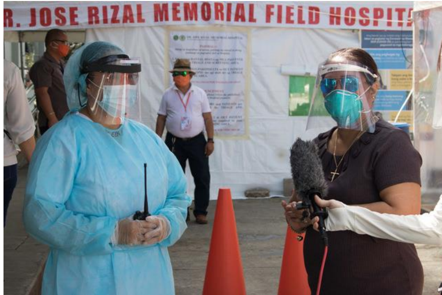
CHAMBERS. Hospital officials

“Other LGUs are making their own disinfection facility, but they are using pumps used in carwash, which are strong and would wet the person being disinfected,” Gallemit said.