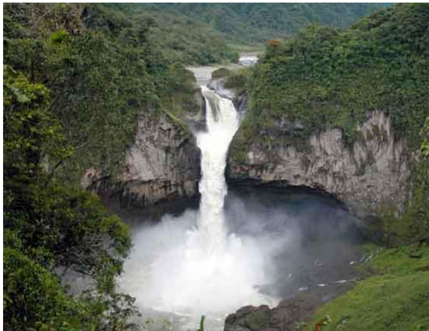
San Rafael Waterfall on the Coca River.

San Rafael Waterfall on the Coca River was a prominent tourist attraction for the country and, according to the National Aeronautics and Space Administration (NASA), drew tens of thousands of people every year. The water dropped 150 feet into a crater-like opening on the other side.