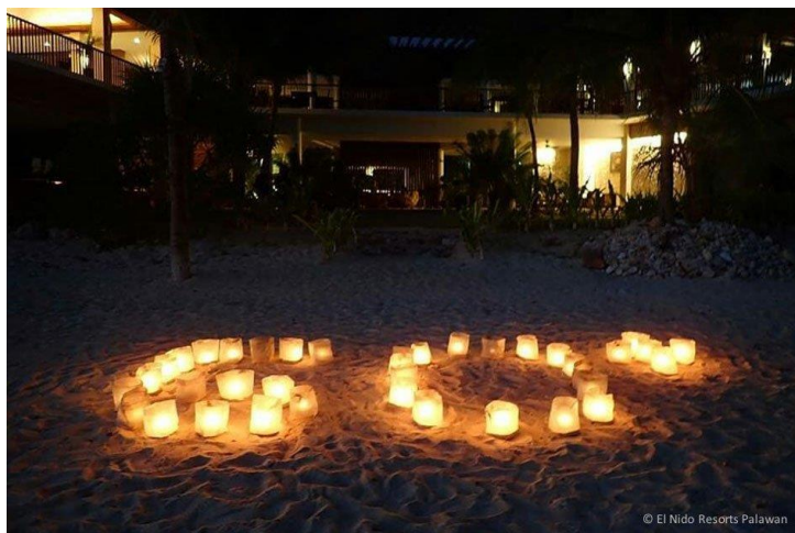
The Philippines joins this year's Earth Hour.

Earth Hour celebrations continued this year on March 28 with activities through the various digital assets of the World Wide Fund for Nature (WWF) Philippines amid the global COVID-19 outbreak.