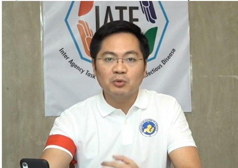
Cabinet Secretary Karlo Alexei Nograles

The government is readying the parameters on the possible lifting, extension or expansion of the enhanced community quarantine (ECQ) in Luzon, a Palace official said on Tuesday.