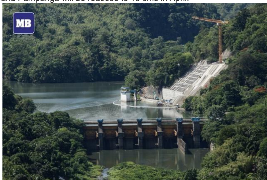
A part of Angat Dam is seen at Norzagaray, Bulacan.

From 20 cubic meters per second (cms) of raw water coming from Angat Dam, the irrigation allocation for farmlands in Bulacan and Pampanga will be reduced to 15 cms in April.