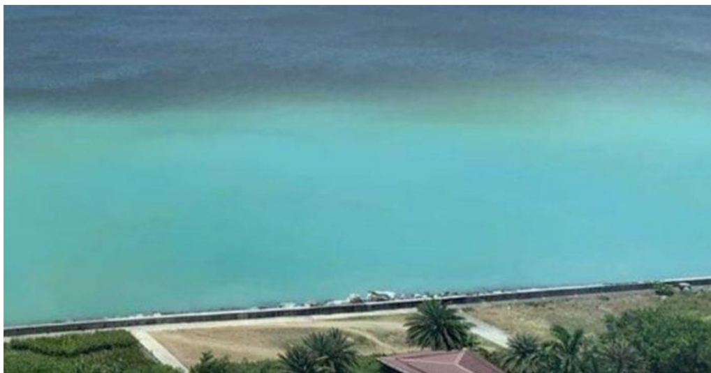
The turquoise color may indicate pollution.

THE Department of Environment and Natural Resources (DENR) has ordered an investigation of hotels and establishments in the Manila Bay area after discoloration bay waters was observed last week.