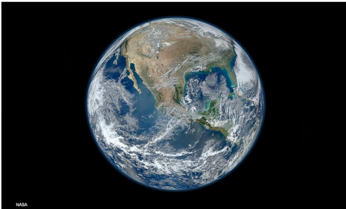
The internet has deemed 2020 canceled. And now everyone's looking for a silver lining. But you know what's not a silver lining of this pandemic? Fixing the climate crisis. (FILE PHOTO)

(CNN) — The internet has deemed 2020 canceled. And now everyone's looking for a silver lining.