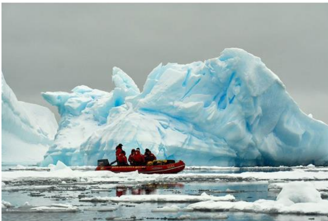
This handout photo taken in February 6, 2020 and released on March 31, 2020 by the Australian Antarctic Division (AAD) shows expeditioners cruising past icebergs in an inflatable boat near the ADD's Mawson Station in Antarctica.

KOROR, Palau - A coronavirus-free tropical island nestled in the northern Pacific may seem the perfect place to ride out a pandemic -- but residents on Palau say life right now is far from idyllic.