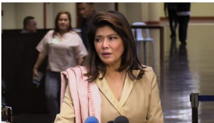
Sen. Imee Marcos.

MANILA, Philippines — Continued water service interruptions in Metro Manila reduce the effectiveness of the enhanced community quarantine imposed over Luzon due to the 2019 coronavirus disease (COVID-19) outbreak.