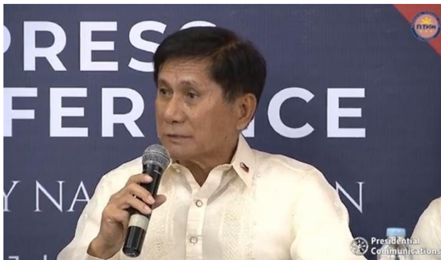
Environment Secretary Roy A. Cimatu

Environment and Natural Resources Secretary Roy Cimatu on March 31, Tuesday, encouraged Filipinos to consider the enhanced community quarantine as an opportunity to develop a lasting commitment to eco-friendly habits.