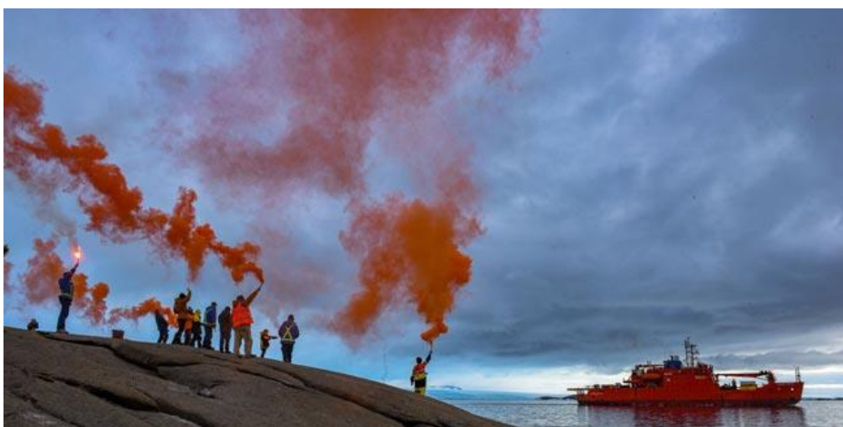
Mawson Station, Antarctica: This handout photo taken on February 20, 2020 and released on March 31 by the Australian Antarctic Division shows the Aurora Australis leaving the winter team of 19 expeditioners at Mawson research station for the rest of the 2020. Inside Australia's four remote Antarctic research bases, some 89 people find themselves ensconced on the only COVID-19 coronavirus-free continent as they watch their old home transform beyond recognition.

The microstate of 18,000 people is among a dwindling number of places on Earth that still report zero cases of Covid-19 — coronavirus disease 2019 — as figures mount daily elsewhere.