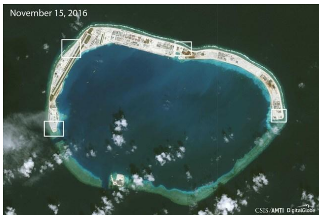
PANGANIBAN REEF. Structures seen in a satellite image of Panganiban (Mischief) Reef on November 15, 2016, released December 13, 2016.

National Security Adviser Hermogenes Esperon Jr said the vessels were likely to remain in the vicinity of Pag-asa Island because of its proximity to Zamora Reef, which he believes may serve as a harbor for the Chinese vessels.