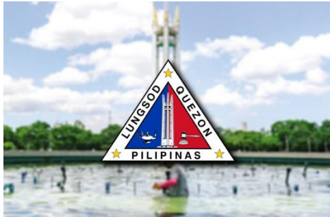
Quezon City

Air quality in Quezon City has been improving as people stay home during the implementation of the enhanced community quarantine in Luzon, according to an expert from the University of the Philippines Diliman (UP Diliman).