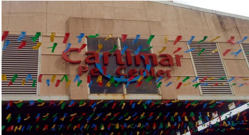
Cartimar Pet Center

The Pasay City veterinarian office on Tuesday clarified the rumors about the alleged negligence by pet owners in a pet market in the city.