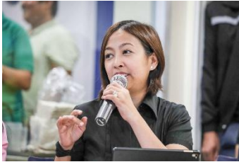
Makati Mayor Abby Binay

https://news.mb.com.ph/2020/03/24/makati-city-residents-urged-to-practice-otso-otso-cleaning-habit-to-combat-covid-19/