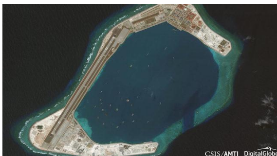
ZAMORA REEF. This satellite photo shows vessels inside the harbor of Zamora (Subi) Reef, reclaimed and built into a military base by China.

The two new stations complement the CAS’ Meiji Research Center built earlier on Panganiban (Mischief) Reef , which China calls “Meiji.” Together, the 3 outposts have formed an “integrated scientific research base” for China, the report said.