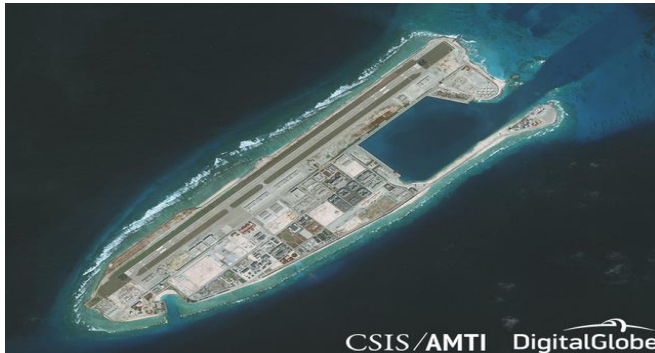
KAGITINGAN REEF. This satellite image dated January 1, 2018, shows Kagitingan (Fiery Cross) Reef in the West Philippine Sea.

https://www.rappler.com/nation/255587-china-opens-new-research-outposts-west-philippine-sea-march-2020