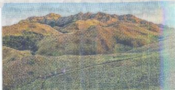
ABOUT TIME Mt. Pulag, Luzon's highest peak, enters the list of the country's protected areas under new laws signed by President Duterte on April 8 and announced by the Palace on Thursday.

Mount Pulag (Luzon's highest peak), Mount Arayat in Pampanga, the historic Tirad Pass in Ilocos Sur, and other sites in two other provinces should now be deemed safer from destructive human exploitation after President Duterte signed separate laws designating them as protected landscapes. Their status as protected areas will help safeguard their rich biodiversity for the stewardship of future generations. —STORY BY JEROME ANING