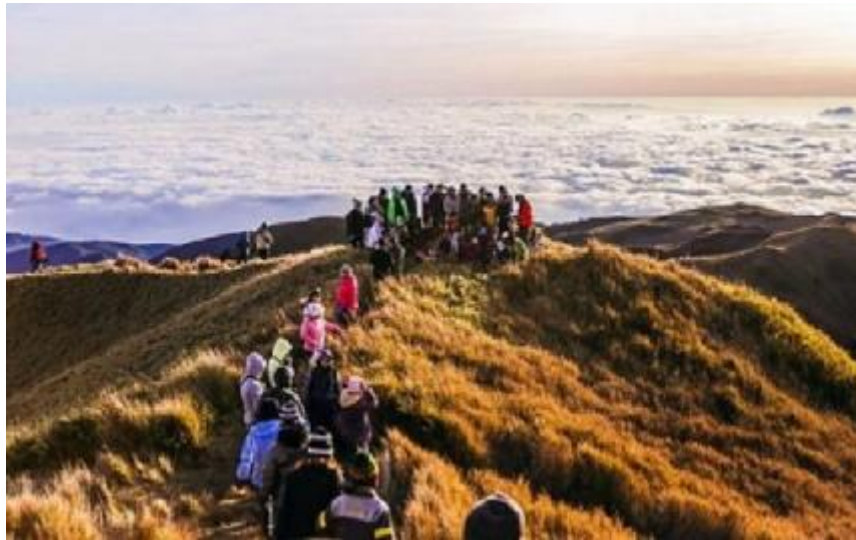
An undated photo showing tourists viewing a sea of clouds.

By Ruth Abbey Gita-Carlos | Philippine News Agency