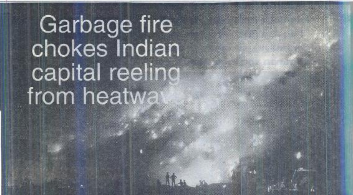
THE fire was the fourth to break out in less than a month at a landfill in New Delhi, where a running heatwave has added extra discomfort to the city's hot and dry spring climate. AFP

NEW DELHI, AFP — Indian fire-fighting teams poured truckloads of sand and mud to douse a huge rubbish dump blaze on Wednesday after thick and putrid smoke from the inferno choked the country's unseasonably hot capital.