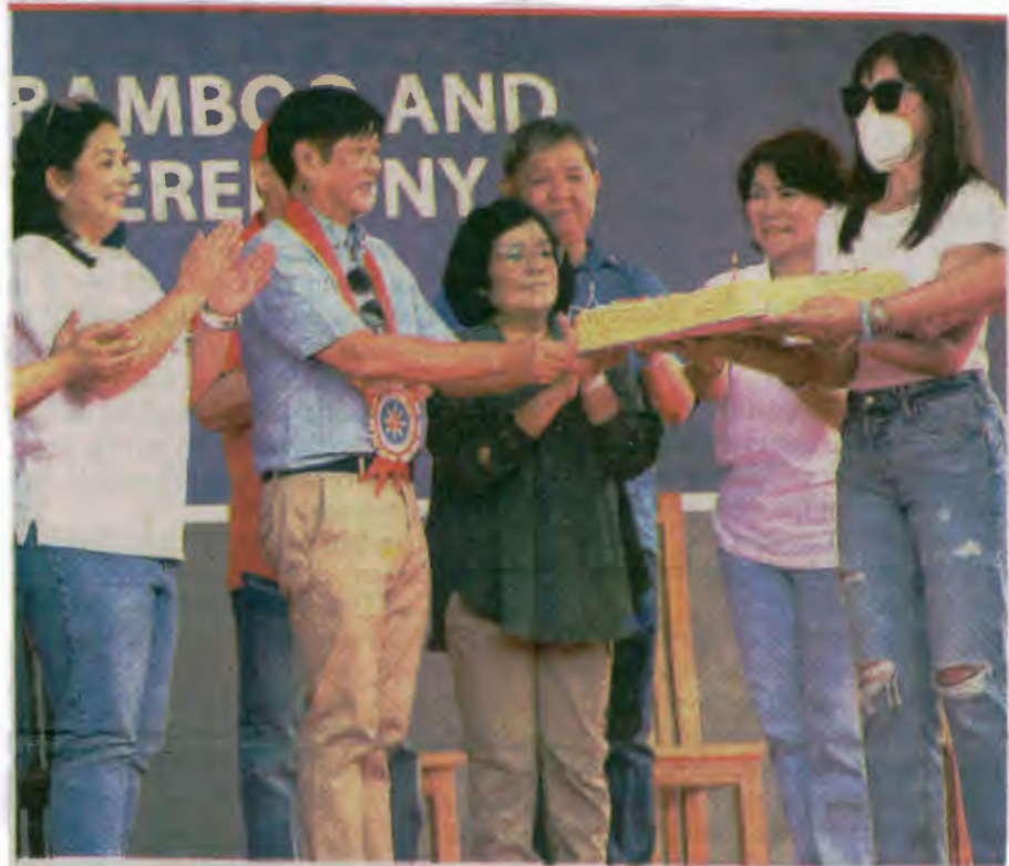
HAPPY BIRTHDAY, MR. PRESIDENT. Employees of the Environment and Interior departments present a birthday cake to President Ferdinand Marcos Jr. during the Simultaneous Bamboo and Tree Planting Ceremony at the Old Sanitary Landfill in Barangay Pintong Bukawe, San Mateo, Rizal on Tuesday (story below).