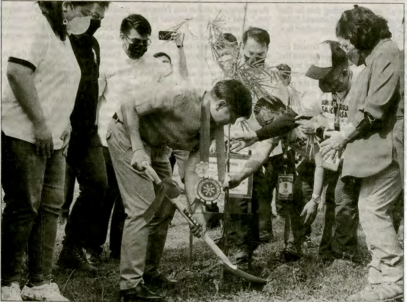
President Marcos leads the simultaneous bamboo and tree-planting kick off ceremony in San Mateo, Rizal yesterday morning to mark his 65th birthday.

TITLE: Marcos marks 65th birthday with tree-planting, gift-giving PAGE 1/2