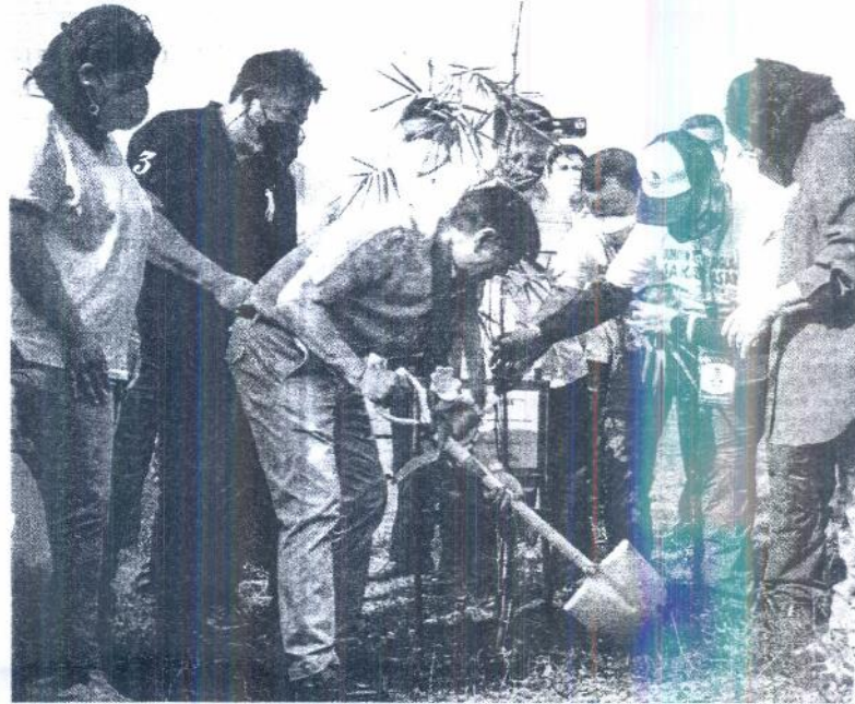
President Ferdinand 'Bongbong' Marcos Jr. plants a bamboo in Barangay Pitong Bocaue, San Mateo, Rizal.

The tree-planting sites are San Mateo in Rizal; Majayjay, Laguna; Trece Martires City, Cavite; Mataas na Kahoy, Batangas, and Dolores, Quezon.