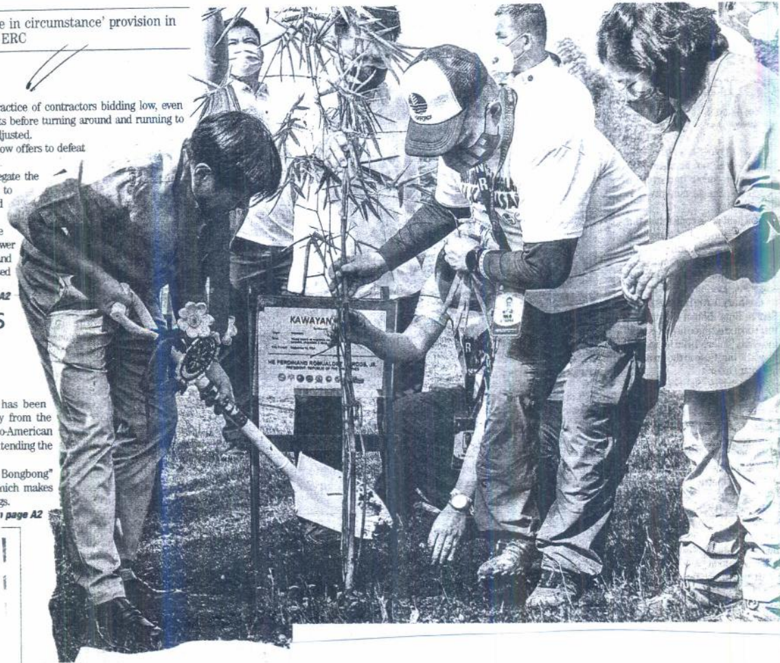
Leaving a legacy To celebrate his 65th birthday, President Ferdinand Romualdez Marcos Jr. chose to lead the National Simultaneous Bamboo and Tree Planting lock-off ceremony at the Old San Mateo Sanitary Landfill on Tuesday, 13 September 2022.