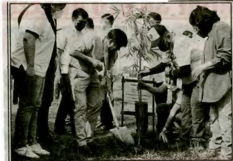
Pinangunahan ni Pangulong Ferdinand Marcos Jr. ang tree planting na isinagawa sa San Mateo, Rizal kahapon ng umaga kasabay sa pagdiriwang niya ng kanyang ika-65 kaarawan.