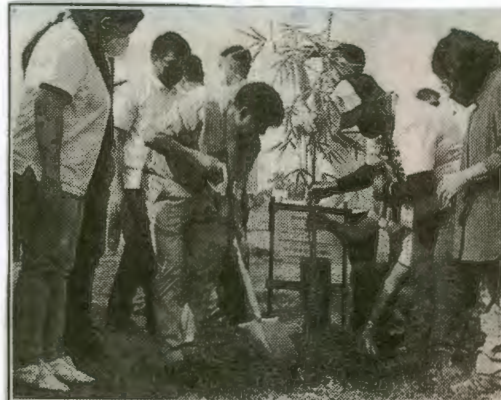
Pinangunahan ni Pangulong Marcos ang sa- bayang pagtanim ng mga kawayan at puho sa mismong Ika-65 kaarawan niya kahapon na ginawa sa San Mateo, Rizal.