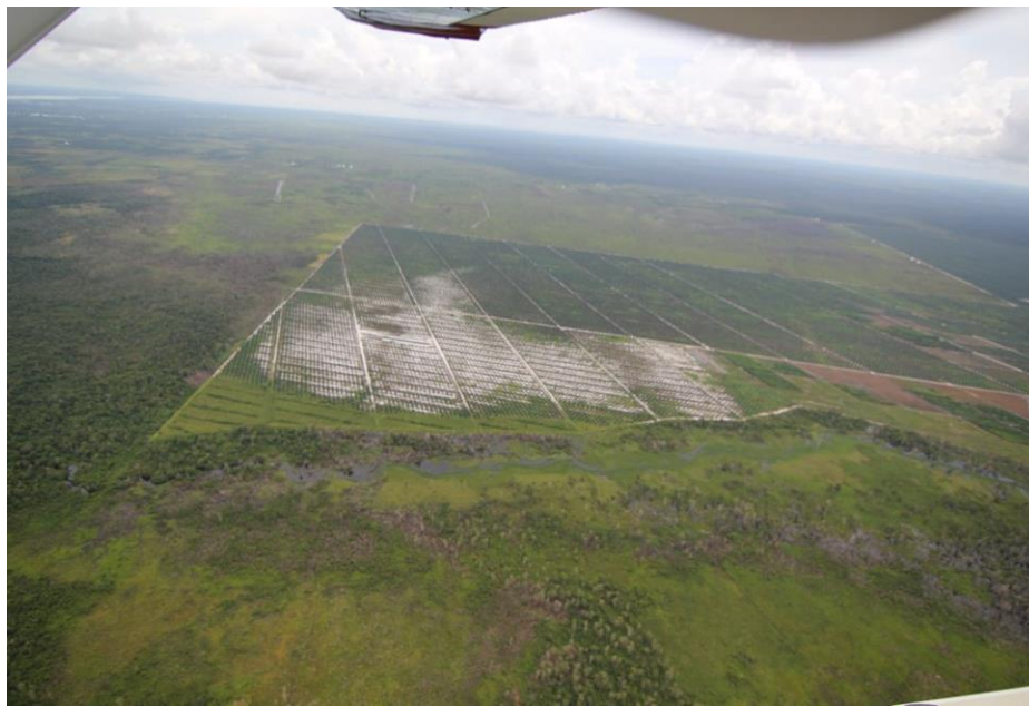
Aerial view of deforestation for palm oil on peatland in Central Kalimantan, Borneo, in Indonesia.

Zero-deforestation commitments from multinational consumer brands may be helping to slow tropical forest destruction in Indonesia, Malaysia and Papua, meanwhile the region's top deforesters are expanding plantations to produce biofuel.