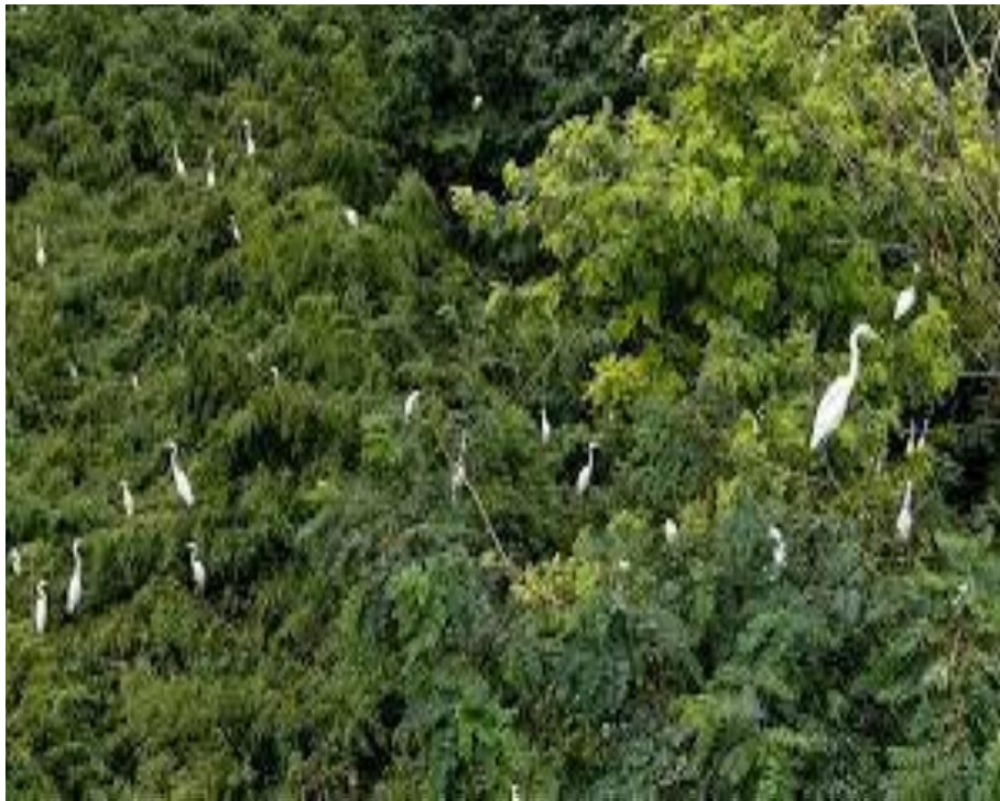
Aerial photo shows egrets resting on top of trees at the Dafeng Milu National Nature Reserve in the city of Yancheng, east China's Jiangsu Province, June 26, 2019.

By Agence France-Presse October 12, 2021