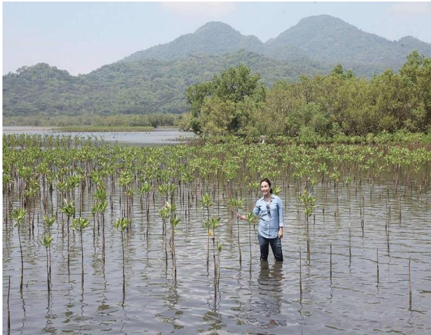
Deputy Speaker, staunch environmental advocate and 'Our Fragile Earth' host Loren Legarda.

In her first term as senator, Legarda authored the Mt. Kitanglad Range Protected Area Act, which was signed into law in 2000.