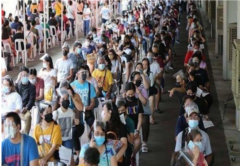
Residents of Marikina City line up for their second dose of COVID-19 vaccine at mega vaccination site in Marikina Sports Center on July 8, 2021.

MANILA, Philippines — The Philippines has fully vaccinated some 30% of the 70 million it is targeting to inoculate this year, Malacañang said Monday.