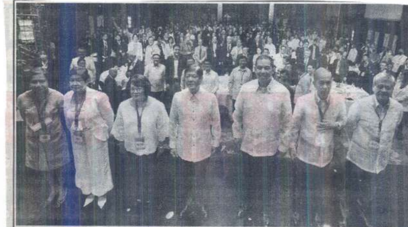
SINA Pangulong Ferdinand 'Bongbong' Marcos, Jr. kasama si House Speaker Martin Romualdez (ikatlo mula kanan) sa isang photo opportunity nang dumalo ang mga ito sa 2022 DENR Multi-stakeholder forum kahapon sa Diamond Hotel sa Maynila. Kasama rin sa mga dumalo ang ilang government officials at gabinete ng Marcos administration.