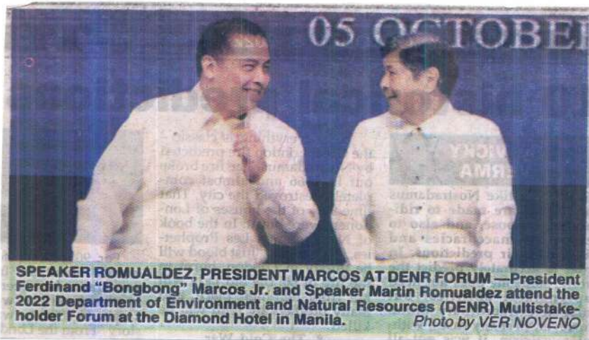
SPEAKER ROMUALDEZ, PRESIDENT MARCOS AT DENR FORUM —President Ferdinand “Bongbong” Marcos Jr. and Speaker Martin Romualdez attend the 2022 Department of Environment and Natural Resources (DENR) Multistakeholder Forum at the Diamond Hotel in Manila.