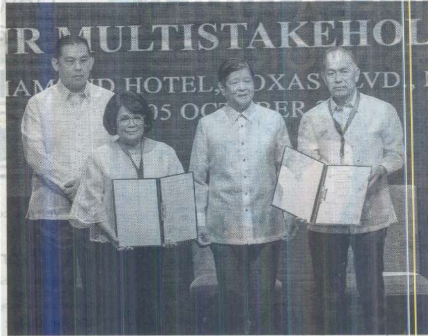
PRESIDENT Ferdinand Marcos Jr. attends the 2022 DENR Multistakeholders Forum on Wednesday in Diamond Hotel, Manila. Also in attendance is Speaker Martin Romualdez. Both officials presented plaques to awardees.