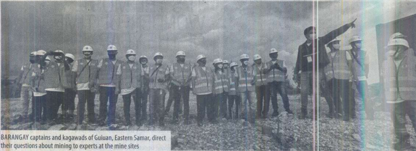
BARANGAY captains and kagawads of Guiuan, Eastern Samar, direct their questions about mining to experts at the mine sites

B ARANGAY captains and councilors from the 30 coastal barangays of Guiuan, Eastern Samar, including Manicani, personally directed their questions about responsible mining to the experts at Cagdianao Mining Corp. (CMC) and Hinatuan Mining Corp. (HMC), subsidiaries of Nickel Asia Corp. (NAC).