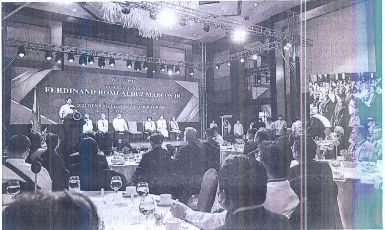
PRESIDENT Ferdinand Marcos Jr. delivers a speech at the 2022 Department of Environment and Natural Resources Multistakeholder Forum on Wednesday, October 5, 2022, at the Grand Ballroom, Diamond Hotel, Manila.