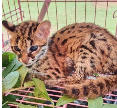
Visayan leopard cat, locally known as 'maral'

A rare Visayan leopard cat was spotted in Ajuy, Iloilo in April.