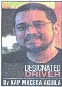
DESIGNATED DRIVER By KAP MACEDA AGUILA

Range is perhaps the most pervasive customer pain point - and, for sure, the biggest source of anxiety - in electric vehicles (EVs). Indeed, who wants to be caught in the middle of nowhere with a dead battery?