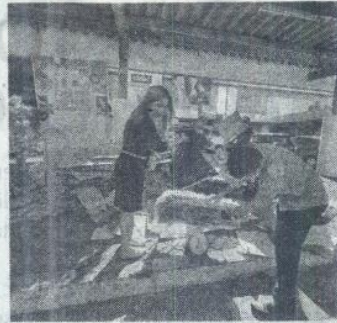
■ SM Cares turns trash into cash. CONTRIBUTED PHOTO gather more than 19 tons of recyclables and electronic waste from its Earth Day activities.

On April 22, SM Cares also held the "SM Earth Day Challenge" wherein SM employees were encouraged to bring in items for recycling such as cardboard, paper, old books and newspapers, polyethylene terephthalate and other plastic bottles, tin and aluminum cans, old kitchen items, and small e-waste such as old mobile phones, chargers, earphones, computer cords, ink toner bottles and cartridges, and calculators, among others. In total, SM was able to