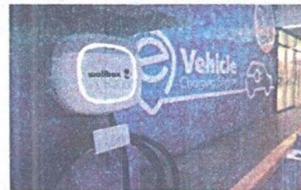
Two Wallbox Pulsar Plus 7.4KW AC chargers with Type 2 connectors are deployed at each of four SM Supermall locations.