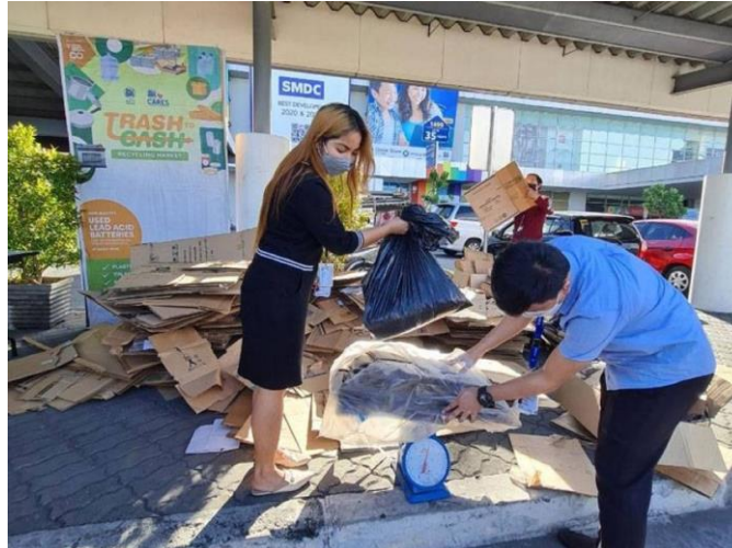
SM Cares turns trash into cash.

SM Cares, the corporate social responsibility arm of SM Supermalls, recently joined this year's Earth Day celebrations by promoting the responsible disposal of recyclables and e-waste among its mall-goers and employees, highlighting the government's various efforts in helping preserve the country's waterways.