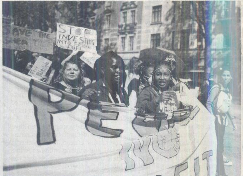
ACTIVISTS of the Fridays For Future climate action movement demonstrate in central Stockholm on June 3, 2022, in connection with the Stockholm +50 UN meeting.