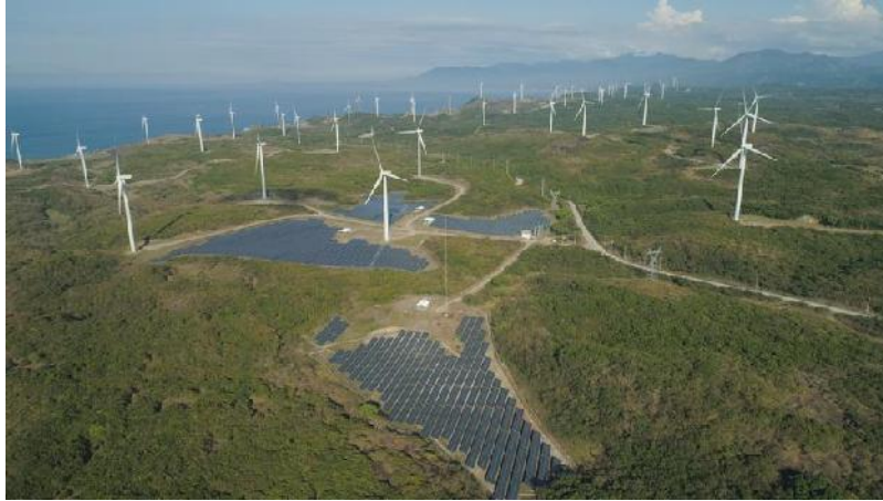
Aerial view of solar farm and windmills for electric power production in Ilocos Norte.

FOOD security, climate change, and renewable energy (RE) were among the topics discussed by President-elect Ferdinand “Bongbong” R. Marcos Jr. with ambassadors from Spain, Morocco, and Germany during separate meetings on Tuesday morning.