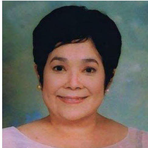
Ma. Antonia “Toni” Yulo-Loyzaga