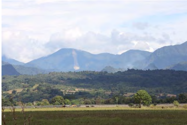
A landslide hits the Sierra Madre mountain range on June 1, 2022.

MANILA — A bill seeking to establish a government agency to manage the Sierra Madre Mountain Range has been refiled at the House of Representatives.