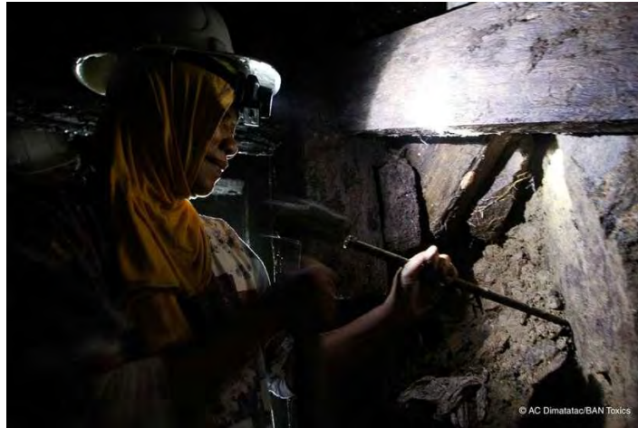
Small-scale miner digs through tunnels for gold ores.

Toxics and wastes watchdog group BAN Toxics spotlights their partner organization, the National Coalition of Small-Scale Miners in the Philippines, in time for the coalition's incoming third national assembly on July 28 to 30, 2022.