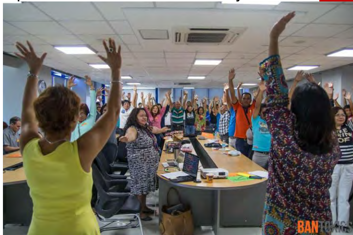
Participants warm up during the 4th National ASGM Summit in Davao City last April 2016.

The union also aims to uplift the lives of ASM community members through responsible mining .