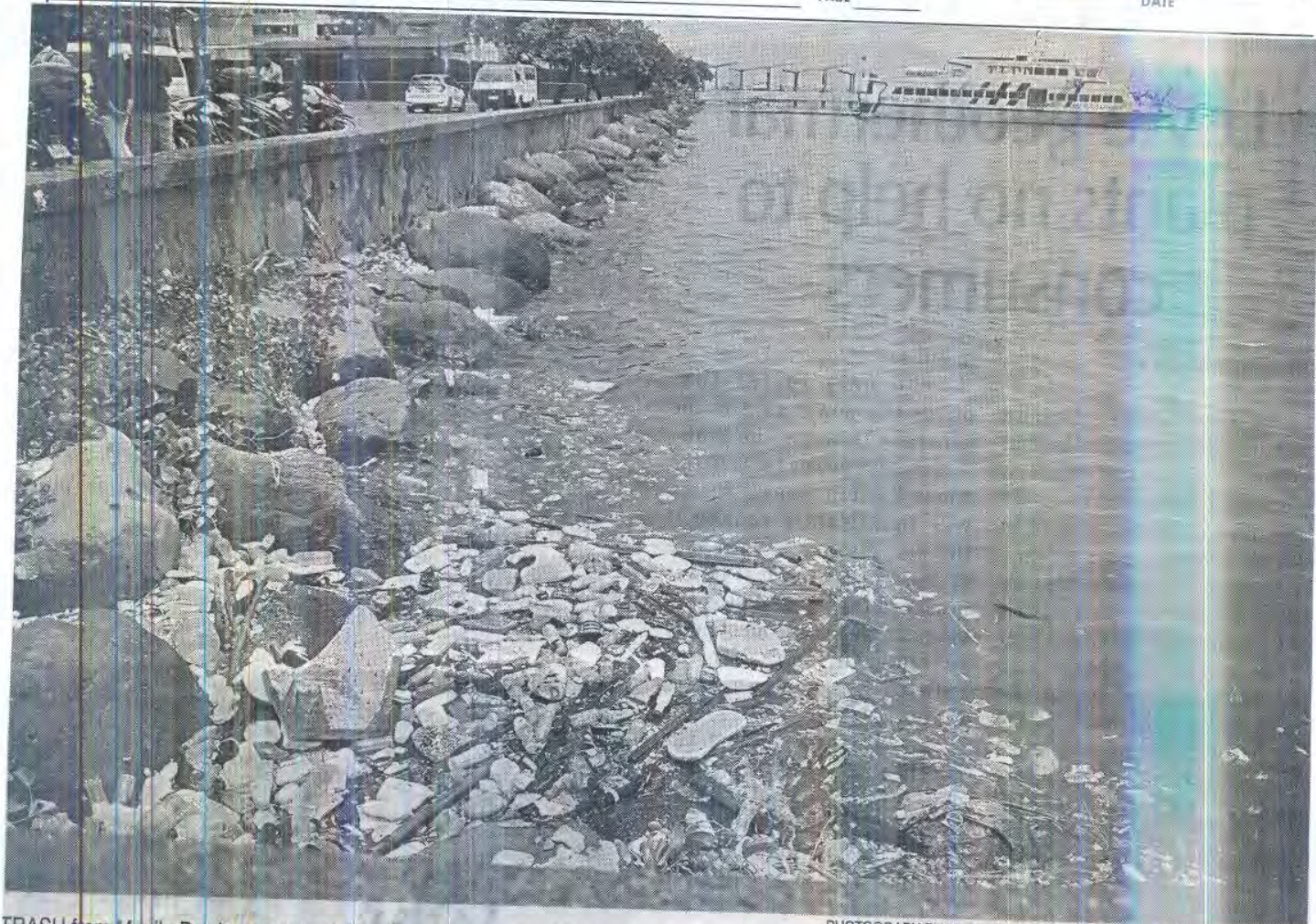
TRASH from Manila Bay is washed ashore along the seawalls of Diokno Bridge near the Mall of Asia complex, providing an eyesore to tourists trying to enjoy the view of the famed Manila sunset.