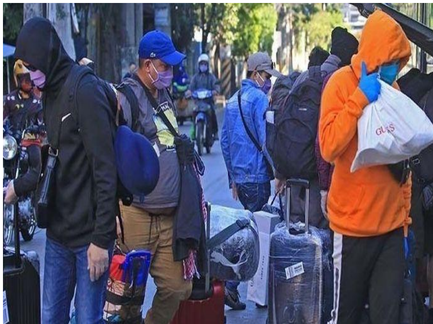
This photo taken on April 2, 2020 shows returning overseas Filipino workers.

MANILA, Philippines — The Philippines has recorded its third case of the Omicron variant—a Filipino who returned from Qatar last month.