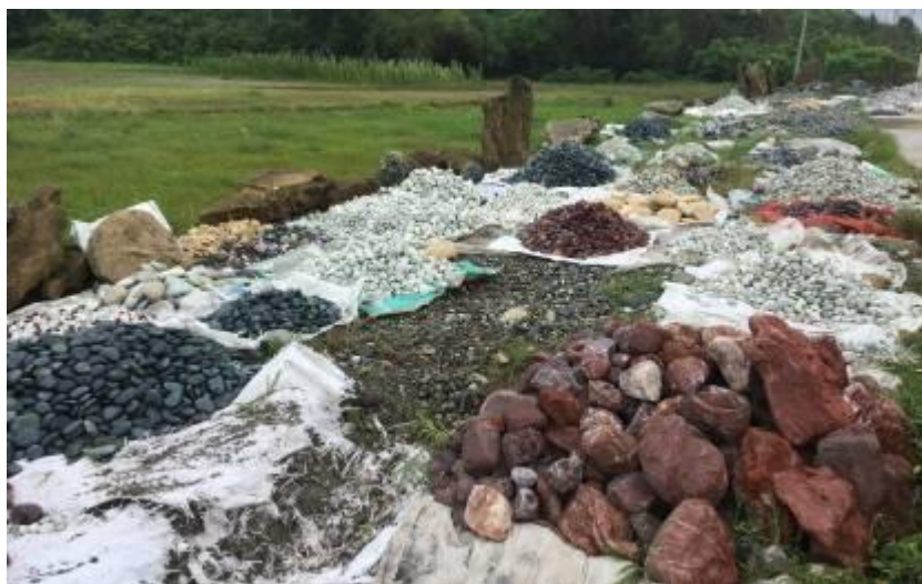
PEBBLES FOR SALE. Pebbles of seven different colors are available for sale along the national highway in Barangay Caruan, Pasuquin, Ilocos Norte.