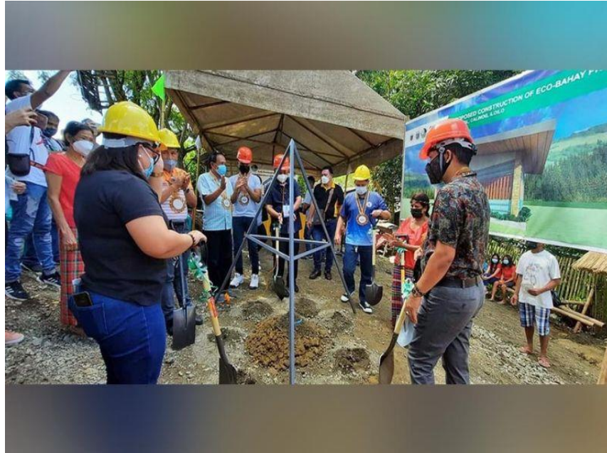
ILOILO. Governor Arthur Defensor Jr. leads the groundbreaking of the "Eco-Bahay" project for the IP community in Barangay Pili, Calinog, Iloilo. The eco house was built out of plastic bottles stuffed with trash. (Capitol PIO)