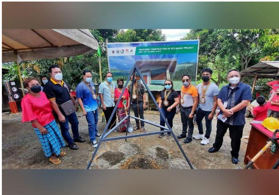
ILOILO. Governor Arthur Defensor Jr. leads the groundbreaking of the "Eco-Bahay" project for the IP community in Barangay Pili, Calinog, Iloilo. The eco house was built out of plastic bottles stuffed with trash.