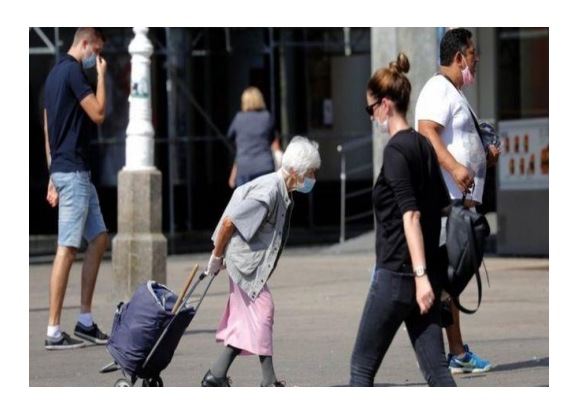
Image captionThe WHO's warning comes as a number of European countries are facing a spike in infections

The global coronavirus death toll could hit two million before an effective vaccine is widely used, the World Health Organization has warned.