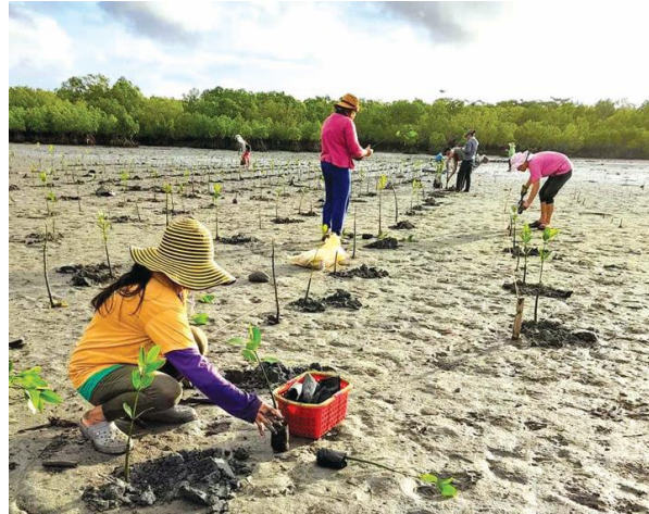
Photo shows employee and community volunteers during recent tree-planting activities in Quezon.

Conglomerate San Miguel Corp. (SMC) on Monday said its groupwide reforestation initiative nationwide has planted 3.8 million trees since 2019 to date, even as it recently completed planting over 26,000 trees in Angat, Bulacan together with the town's Dumagat communities.