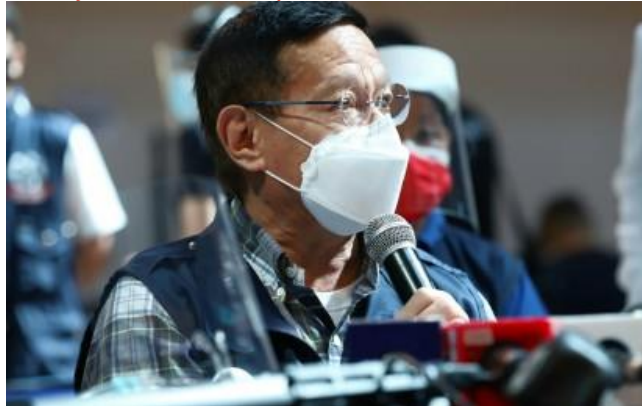
Department of Health Secretary Francisco Duque III