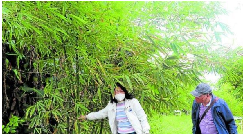
GREEN BARRIER Environment officials inspect over the weekend the bamboos planted along the banks of Cagayan River.

Philippine Daily Inquirer / 04:40 AM January 24, 2022