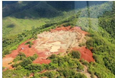
DAVAO ORIENTAL PROVINCIAL GOVT

DAVAO ORIENTAL'S governor has asked the Environment department to permanently cancel the permit of the mining operators that caused water pollution in Mapagba and Pintatagan Rivers.