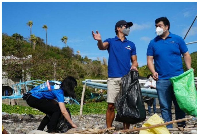
Piolo Pascual and Rep. Alfred Delos Santos of Ang Probinsyano Partylist

The community cleanup activity yielded a total of 135 kilograms of waste materials collected by 50 volunteers headed by the local tourism office of Mabini. Representatives from the Department of Environment and Natural Resources (DENR) were also present for proper documentation and disposal of the collected materials.