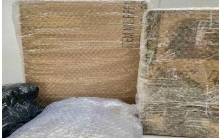
Packages draped in disposable plastic bubble wrap

MANILA – The pandemic-driven surge in online merchandise sales is generating a huge volume of new plastic waste every day, mainly from the widespread use of “bubble wraps” to package goods ordered by consumers, Makati City Rep. Luis Campos Jr. said on Sunday.