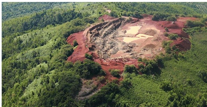
Aerial photo of the nickel mining operations site in Banaybanay, Davao Oriental.

In a letter addressed to the Department of Environment and Natural Resources (DENR) Secretary Roy Cimatu, Dayanghirang cited the violation of the company that left the rivers stained orange from nickel laterite following the heavy downpour last week.