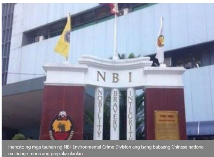
Inaresto ng mga tauhan ng NBI-Environmental Crime Division ang isang babaeng Chinese national na itinago muna ang pagkakakilanlan.

MANILA, Philippines — Limang buhay na King Cobra ang nasabat ng mga tauhan ng National Bureau of Investigation (NBI) habang ibinebenta sa isang pet shop sa Binondo, Maynila kamakalawa.