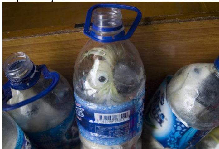
This photograph taken on May 4, 2015, shows rare Indonesian yellow-crested cockatoos placed inside water bottles confiscated from an alleged wildlife smuggler.

Black-capped lorries are a type of parrot native to New Guinea and nearby smaller islands. "The ship's crew told us that they suspected there were animals inside the box as they heard strange noises," said local police spokesman Dodik Junaidi.