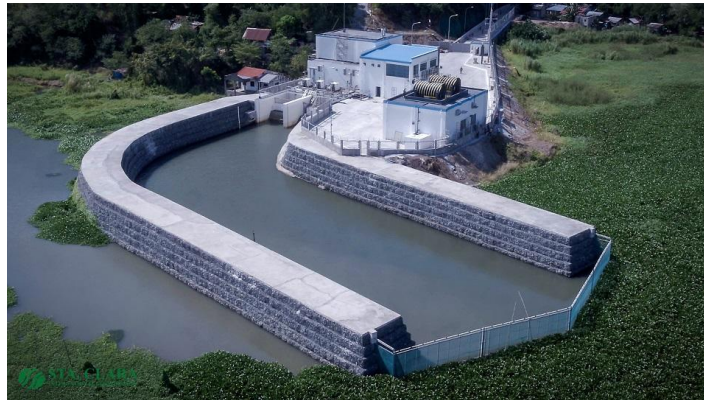
Manila Water's Cardona water treatment plant