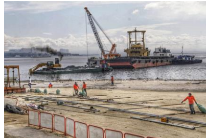
Workers rehabilitate the Manila Bay “white sand” beach made of dolomite after Typhoon Ulysses flooded parts of Metro Manila and Northern and Central Luzon last week.

THE Supreme Court has junked the petition of the Akbayan Citizens’ Action Party seeking to intervene in the Manila Bay case, with a plea to cite the Department of Environment and Natural Resources (DENR) in contempt for dumping dolomite sand—said to be hazardous to health and the environment —on Manila Bay.