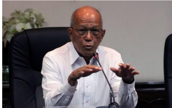
Department of National Defense (DND) Secretary and National Task Force (NTF) Against Covid-19 chair Delfin Lorenzana (File photo)

By Priam Nepomuceno December 20, 2020, 12:19 pm