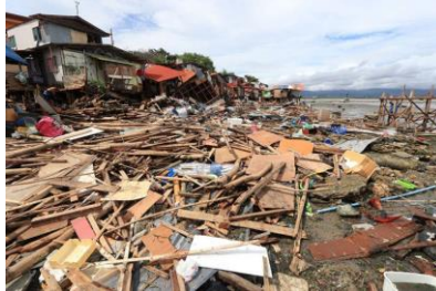
VICIOUS VICKY A general view of destroyed houses after Tropical Depression 'Vicky' hit Lapu-Lapu City in Cebu province on Dec. 19, 2020.

TROPICAL Depression “Vicky” dumped rain in most parts of the country on Saturday, causing floods that initially affected more than 1,000 people in hard-hit Mindanao and prompting the government to abandon its short-lived respite from the previous typhoons to once again roll out its disaster response.