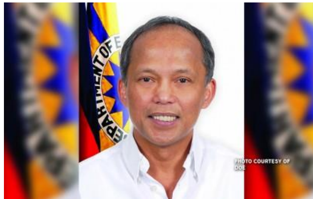
DOE Secretary Alfonso Cusi