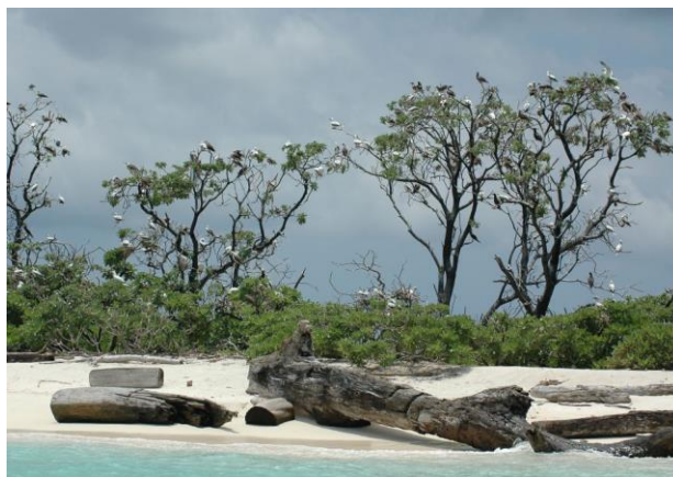
Tubbataha Reefs Natural Park

Tubbataha Reefs Natural Park, known for its high diversity of marine life, is being featured as one of the main attractions at the ongoing United Nations Educational, Scientific, and Cultural Organization (UNESCO) photo exhibition at the UNESCO headquarters in Paris, France from October 7-30, 2020.