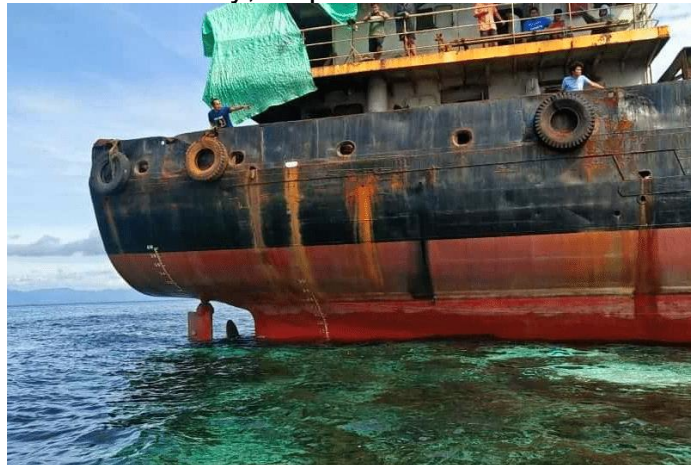
Cargo vessel LCT Golden Star 9 ran aground due to harsh weather conditions in the shallow waters off Surigao del Norte has damaged several corals and marine habitat on Wednesday, Sept. 10, 2021.

A cargo vessel that ran aground due to harsh weather conditions in the shallow waters off Surigao del Norte has damaged several corals and marine habitat, the Philippine Coast Guard (PCG) reported on Wednesday, Sept. 15.