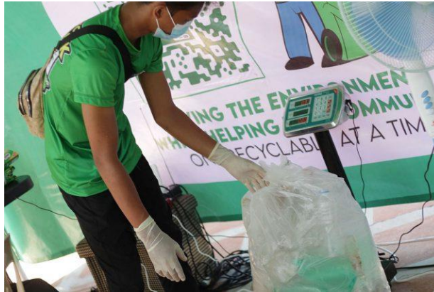
CAGAYAN DE ORO CIO RFELICITAS

CAGAYAN de Oro City formally launched this week a trash-to-cash program that uses an e-wallet for the purchase points that can be earned from turning over recyclable materials.