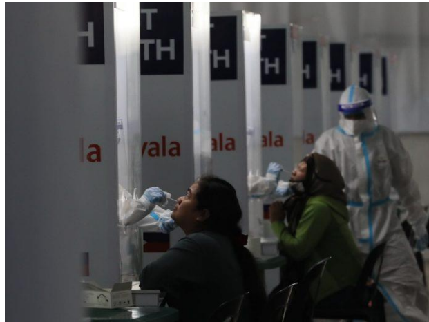
Medical personnel perform a swab test on returning overseas Filipino workers at the Palacio de Maynila along Roxas Boulevard in Malate, Manila on Sunday (May 10, 2020).

The OCTA Research Group said the COVID-19 transmission in the National Capital Region (NCR) has slightly declined anew based on its latest reproduction number.