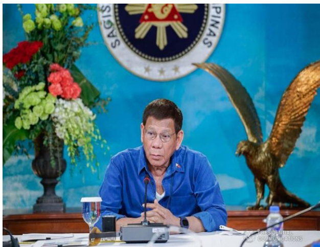
President Rodrigo Roa Duterte

The National Disaster Risk Reduction and Management Council recommended to President Duterte on Monday the declaration of a state of calamity over Luzon due to widespread damages brought by typhoons “Quinta” and “Ulysses,” and super typhoon “Rolly.”