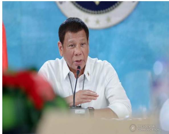
President Rodrigo Roa Duterte

The President however said he prefers a single person over a committee to oversee the river development project in disaster-prone region to ensure its swift implementation.