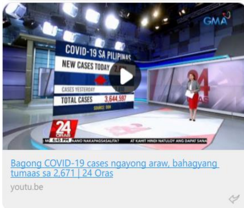
Bagong COVID-19 cases ngayong araw, bahagyang tumaas sa 2,671 | 24 Oras