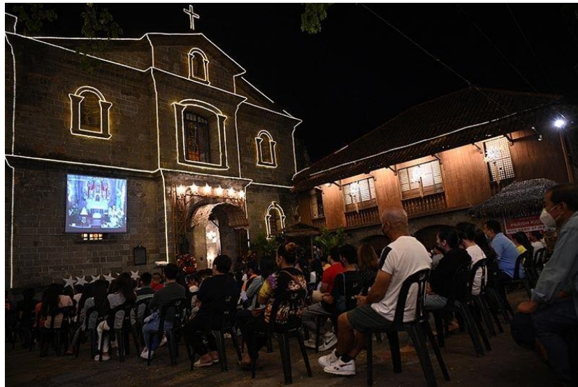
Roman Catholic devotees attend a pre-dawn mass called "misa de gallo" at a church in Las Pinas, suburban Manila, on December 16, 2021, as part of traditional Christmas season celebrations.