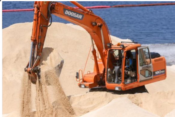
Workers pile the “white sand” to be laid on Manila bay.