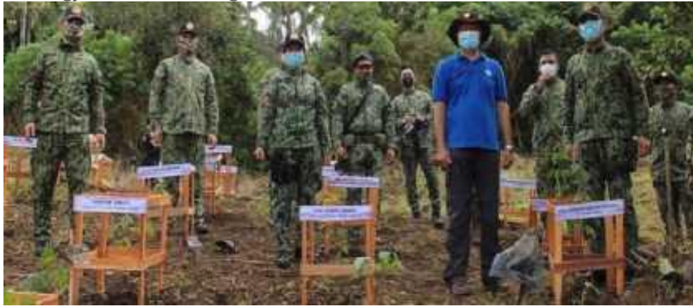
Members of the Laguna PNP pose at the tree planting site in Tayak Hills, Rizal, Laguna.

Camp BGen Paciano Rizal – The Philippine National Police in Laguna planted 1,500 seedlings during the second month of Laguna PPO's "Samahang Pulis Laguna Kapanalig Mo at Makakalikasan held in Tayak hills Bgy. Tala, Rizal , Laguna.