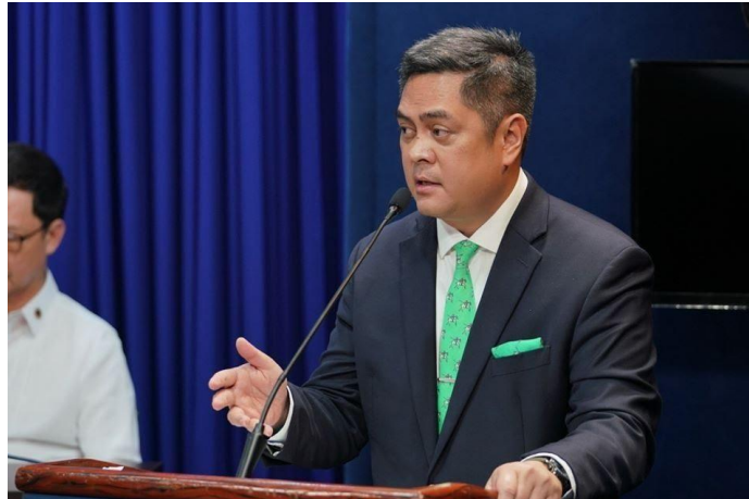
Presidential Communications Secretary Martin Andanar

The government will stay vigilant against the smuggling of foreign wastes following the country's "environmental victory" in sending back the illegal trash shipment to South Korea, Presidential Communications Secretary Martin Andanar said Sunday.