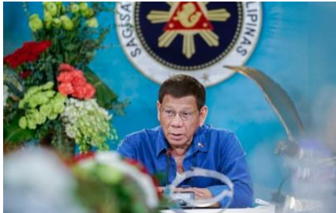
President Rodrigo Duterte.

By Filane Mikee Cervantes November 13, 2020, 2:03 pm