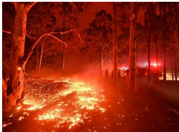
Burning embers cover the ground as firefighters battle against bushfires around the town of Nowra

The government's top science body, the Commonwealth Scientific and Industrial Research Organization (Csiro), and its Bureau of Meteorology released a report on Friday outlining a sobering future for the vast continent nation that was devastated by bushfires in 2019-2020 after its hottest and driest year on record.