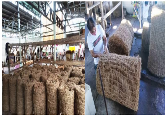
Coconet finished products

“Las Piñas River has become a big dumping area of waste coconut husks, which caused the clogging of the riverways. So we thought of controlling the wastes with the people's cooperation. We designated areas where coconut vendors can bring or deposit waste coconut husks. Then we turned those as raw materials for coconet weaving enterprise that we put up,” the senator said. Besides the coconets, even the coco dust became a raw material mixed with household wastes to make organic fertilizer.