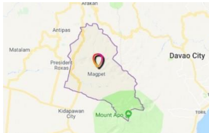
Google map of Magpet, North Cotabato

By Edwin Fernandez November 13, 2020, 8:33 pm