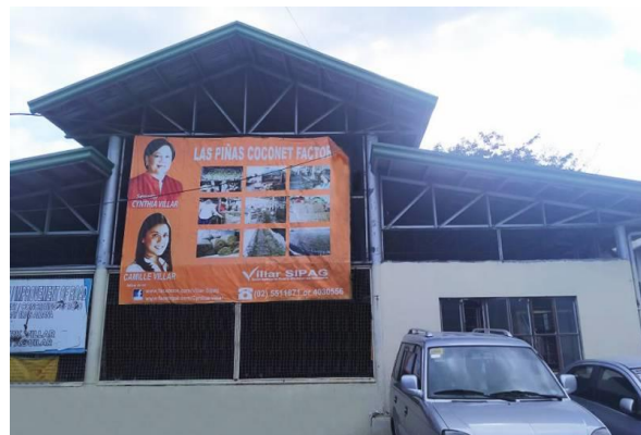
Las Piñas Coconet Factory

“There are two-fold benefits in turning waste coconut husks into something useful, we got rid of garbage that used to litter our streets and clog our rivers and waterways. Secondly, we helped residents by providing them with livelihood and additional source of income. It’s a win-win for people and the environment,” said Villar who is chairperson of both the Senate Committees on Agriculture and the Environment.