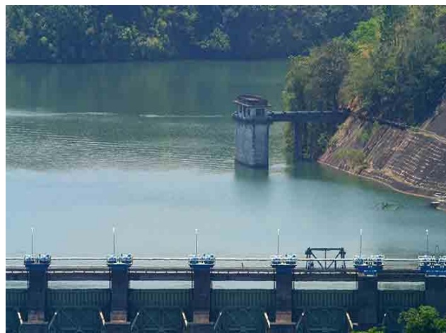
Angat Dam