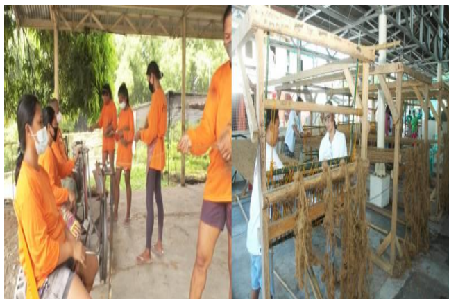
Twining and weaving

The coco peat or dusts extracted by the same machine are mixed with household wastes to make organic fertilizers. All the fertilizers produced are distributed all over the country and given free to farmers and urban gardeners. These have become in demand during the pandemic when the popularity of growing one's food and vegetable gardening dramatically increased.