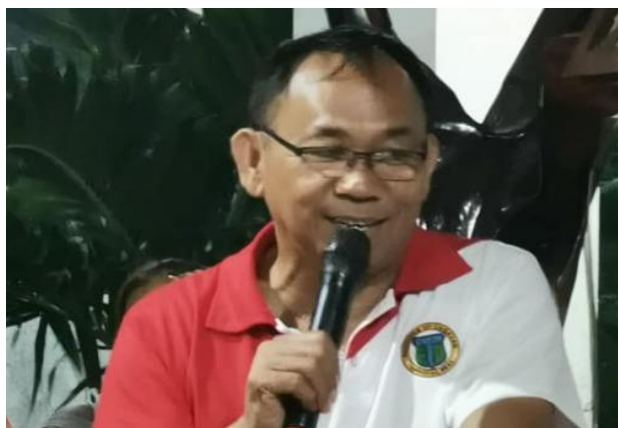
Cagayan Gov. Manuel Mamba

Umaabot din sa 23 mga bayan na binubuo ng 135 na mga barangays ang apektado ng mga pagbaha.