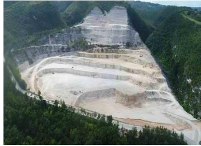
Quarrying site for dolomite rocks in Alcoy town, southern Cebu

By: Morexette Marie B. Erram - Multimedia Reporter - CDN Digital | September 11, 2020 - 05:17 PM