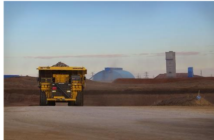
A Rio Tinto mine is shown in this handout photo. Photo from Rio Tinto website

David Millikin, Agence France-Presse Posted at Sep 11 2020 03:06 PM