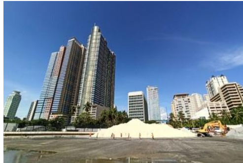
Manila Bay rehabilitation

By Marita Moaje September 10, 2020, 9:11 pm