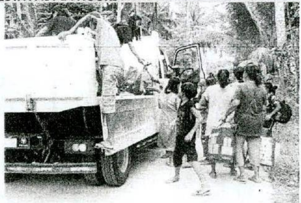
DISRUPTION Residents of ashfall-hit Barangay Puting Sapa in Juban, Sorsogon, are forced to leave their community again on Friday after government volcanologists observed increased seismic activities on Mt. Bulusan.

The provincial disaster risk reduction and management office (PDRRMO) in Sorsogon canceled on Friday all the activities within the 5- to 6-kilometer danger zone due to the increased possibility of another eruption of Mt. Bulusan.