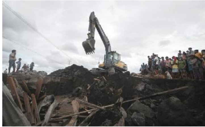
Residents watch as a backhoe clears boulders and mudflows from Mayon Volcano triggered by heavy rains from Typhoon Rolly in the town of Guinobatan, Albay, on Monday, November 2, 2020.

AIDED by unmanned aerial vehicles or drones, at least eight teams led by the Department of Environment and Natural Resources (DENR) have started to investigate claims that quarrying operations around Mayon Volcano triggered a landslide of volcanic debris that buried at least 300 houses and killed six residents in Guinobatan, Albay during the onslaught of Typhoon Rolly.