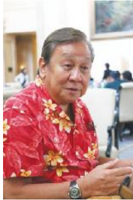
Buhay Rep. Lito Atienza