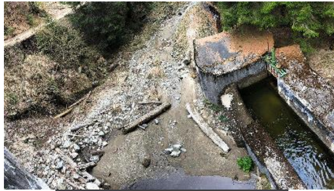
Part of the riverbed has been exposed

Another document by the National Agency for Environmental Protection states: "For the Asprete, the most important species of fish in the area, the main danger is the non-compliance with the easement flow from the Valsan dam."