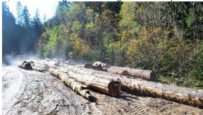
Deforestation in the region is one of many threats the species faces

Other threats include river fragmentation, habitat degradation, illegal waste disposal, and the theft of riverbed gravel and large stones. "Many people take rocks and sand from the river to use in construction," he explains, as the river gushes through the rich alpine landscape.