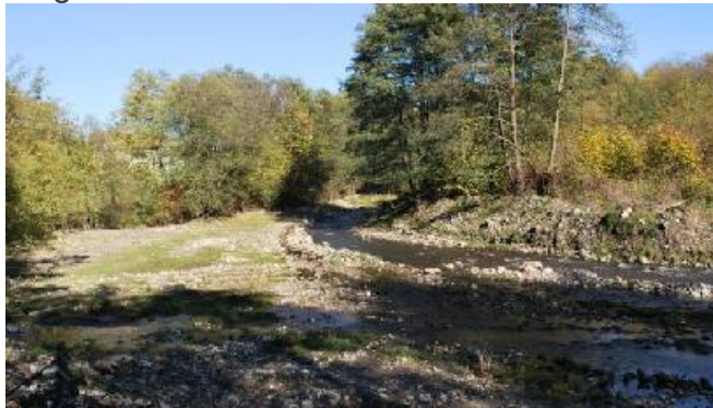
A small stretch of the Valsan river is thought to be home to the entire Asprete population

"Having an Asprete in front of our eyes was fantastic," he told the BBC. "It's one of the biggest rewards a field biologist can get."