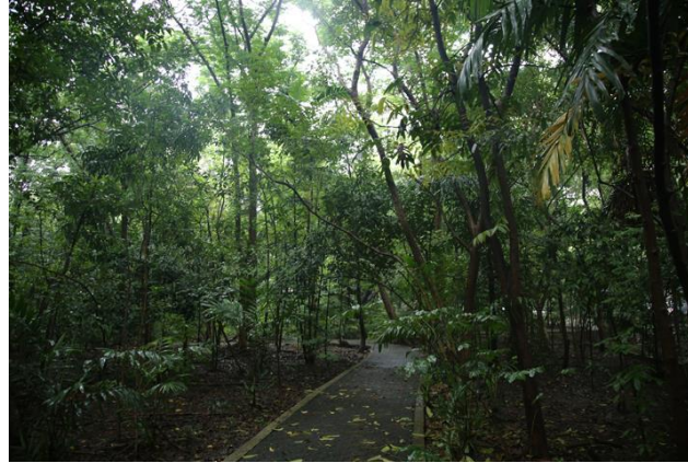
The Arroceros Forest Park in Ermita Manila.

When many people think of New Year's resolutions, they brainstorm ways to improve themselves for the year ahead. What if we expanded those aspirations to include resolutions that benefit our communities, society and the planet, too?