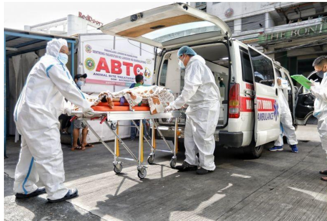
Health workers attend to patients at the Mandaluyong City Medical Center on Wednesday, Jan. 5, 2022.

Agence France-Presse January 8, 2022 | 9:55am