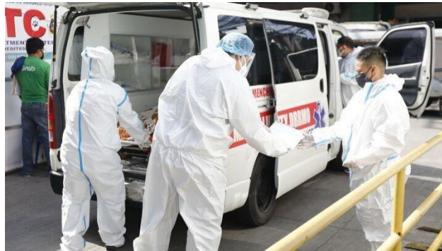
Health workers attend to patients at the Mandaluyong City Medical Center on Wednesday, Jan. 5, 2022.