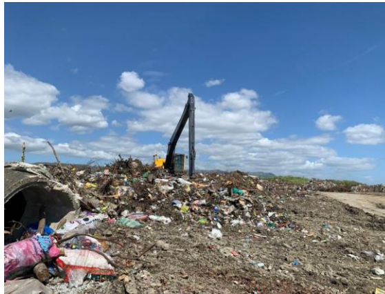
Dumping area for debris at the South Road Properties.

By: Delta Dyrecka Letigio - CDN Digital Multi-Media Reporter | January 06, 2022 - 06:57 PM