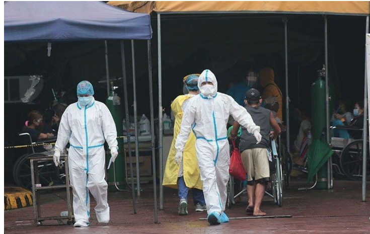
Health workers at the National Kidney and Transplant Institute attend to patients at the triage set up at the hospital lobby on Aug. 15, 2021.

Ludy Bermudo - Pilipino Star Ngayon January 6, 2022 | 12:00am