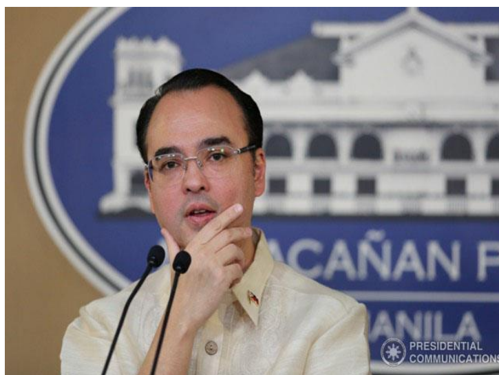
House Speaker Alan Peter Cayetano

Former House Speaker Taguig-Pateros Rep. Alan Peter Cayetano has appealed to the government to put in its priority list the rehabilitation of Laguna Lake that provides livelihood to millions of Filipinos.