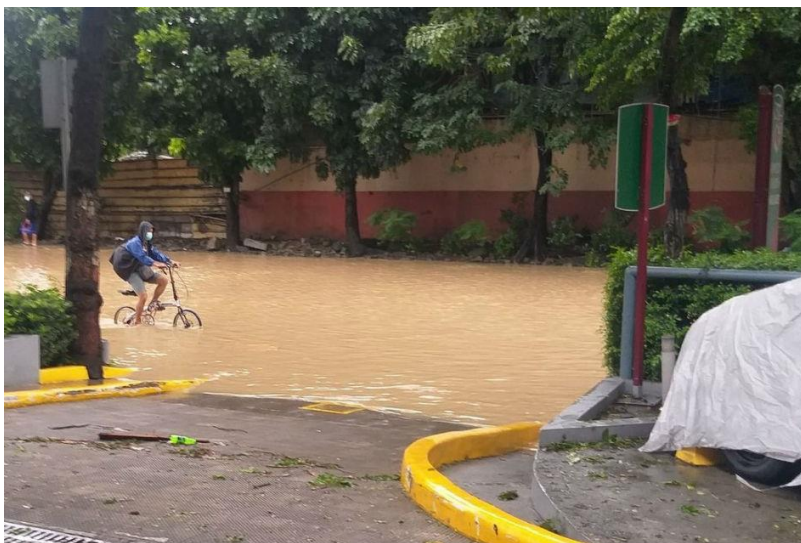
In the city of Pasig, Metro Manila, a cyclist sashes through flash floods caused by Typhoon Goni.

However, the devastating impacts of natural disasters (the most recent example being Typhoon Goni, 2020's strongest storm to date) serve as reminders of the country's vulnerability to human-made climate change.