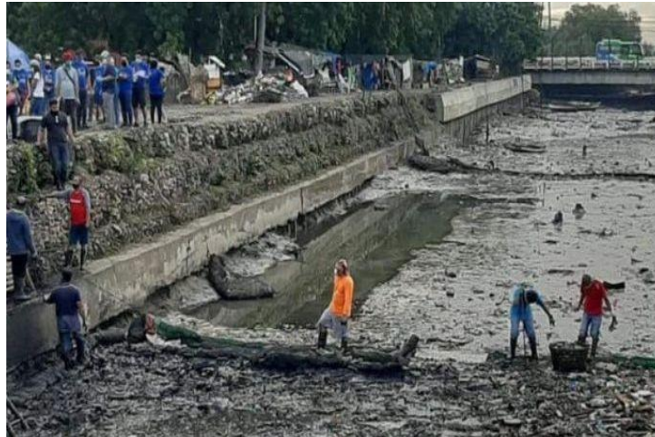
Employees of the Cebu City government take part in a clean-up drive on December 5, 2020. Joy Torrejos

CEBU, Philippines — The Cebu City coastal cleanup drive during the International Volunteer Day last Saturday has collected 41.6 tons of garbage from the rivers and coastal areas.