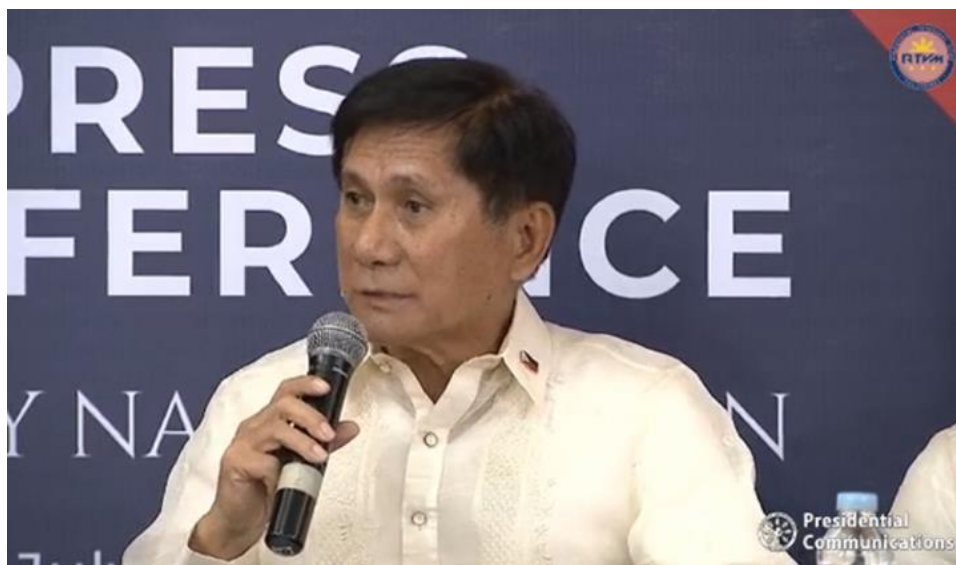
Environment Secretary Roy A. Cimatu

Department of Environment and Natural Resources (DENR) Secretary Roy Cimatu has approved the dredging of sandbars in 19 priority sites along Cagayan River as one of the immediate solutions to prevent another destructive flooding in Cagayan Valley.