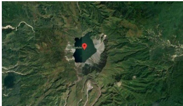
Satellite image ng Bulkang Pinatubo mula sa kalawakan Google Maps

(Philstar.com) - March 4, 2021 - 10:07am