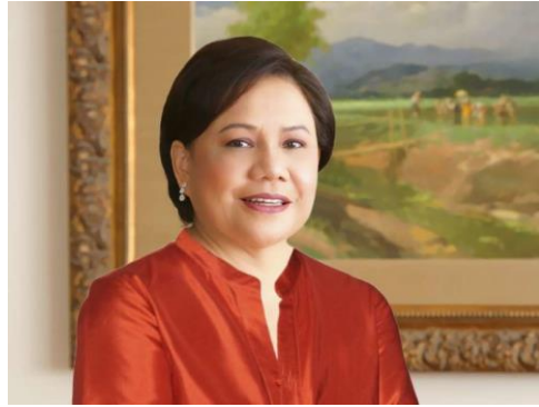
Sen. Cynthia Villar

Senator Cynthia Villar, chairperson of the Senate Committee on Environment and Natural Resources, filed a bill to strengthen wildlife protection and conservation in the country, just in time for the observance of World Wildlife Day today (March 3).