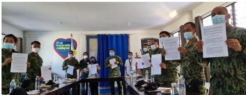
Department of Environment and Natural Resources and Tarlac Police Provincial Office partnered in forest protection and greening program.

MPS shall also act as the overall project manager and shall take charge in the mobilization of personnel prioritizing in hiring the people's organizations within the area.