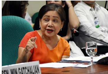
Sen. Cynthia Villar

Senator Cynthia A. Villar, chairperson of the Senate Committee on Environment and Natural Resources, on Thursday filed a bill to strengthen wildlife protection and conservation in the country, just in time for the observance of World Wildlife Day this month.