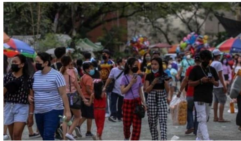
People visit a park in Quezon City, east of Manila on New Year's Day on January 1, 2022.

(Philstar.com) - January 4, 2022 - 10:46am