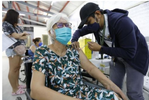
An elderly woman receives a booster shot at the Marikina Sports Complex on Monday, Jan. 3, 2022.

MANILA, Philippines — The Department of Health reported Tuesday 5,434 additional COVID-19 infections, the highest single-day rise since October 23, bringing the number of active cases to nearly 30,000.