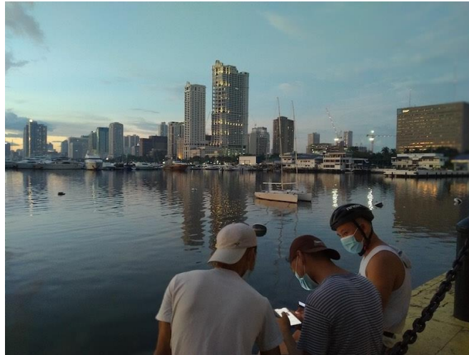
Three men tinker with their mobile devices along Manila Bay at dawn

THE Manila Bay Coordinating Office (MBCO) has revealed a marked improvement in water quality in Manila Bay, particularly the Baywalk area, which is a priority in the government's rehabilitation effort.