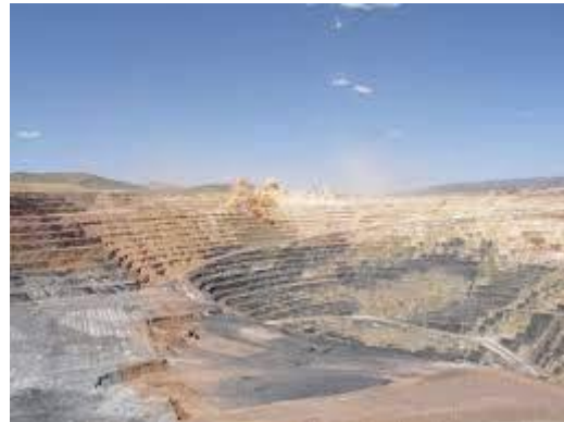
open pit mining

AMID criticisms in the lifting of the ban on open-pit mining method by the Department of Environment and Natural Resources (DENR), the Joint Foreign Chambers issued a statement supporting the DENR's decision.