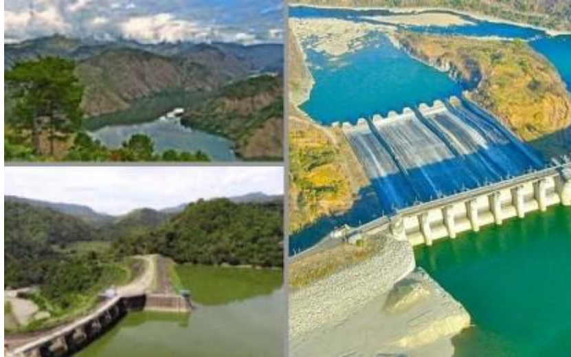
(PNA file photos of Ambuklao, Binga, and Magat Dams)

By Catherine Teves December 4, 2020, 4:00 pm