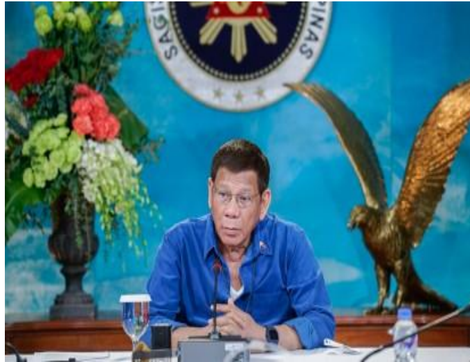
President Rodrigo Duterte