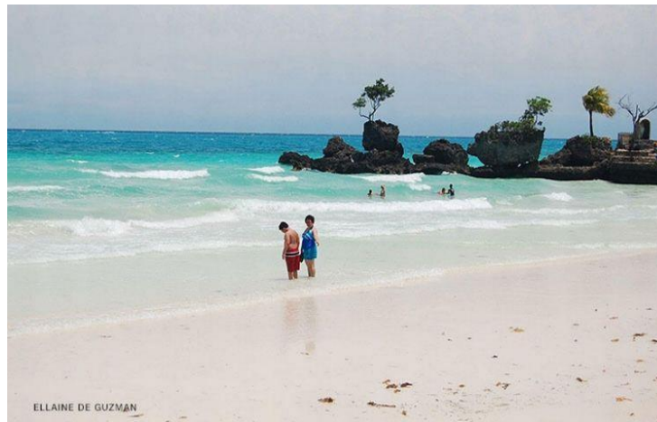
Boracay in 2018 (FILE PHOTO)

Metro Manila (CNN Philippines, December 4) — Poor residents in Boracay who have been forced to vacate their homes due to the ongoing rehabilitation on the island will receive aid and access to "social safety nets", Boracay task force chairman Roy Cimatu assured on Friday.