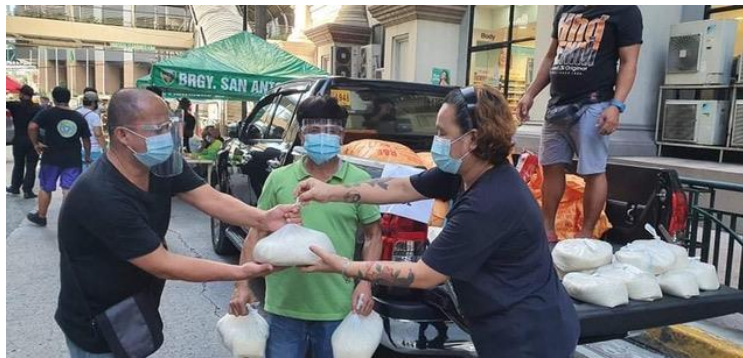
(Barangay San Antonio, Pasig collects plastic waste in exchange for packs of rice.)

A barangay in Pasig City has collected more than 250 kilos of plastic wastes during its waste for rice program recently, which seeks to promote recycling and help residents affected by the pandemic.