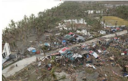
Aerial photo of super typhoon Rolly aftermath in Catanduanes.

By Joyce Ann L. Rocamora November 3, 2020, 8:39 pm