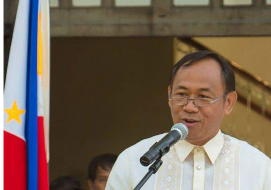
Cagayan Gov. Manuel Mamba. FILE PHOTO

TUGUEGARAO CITY, Cagayan: Gov. Manuel Mamba gave assurances that no black sand mining will take place in the dredging of the Cagayan River.