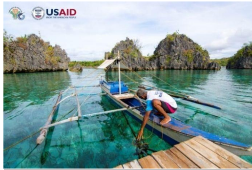
Undated photo of a Filipino fisherman.