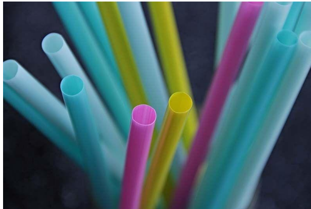
shows plastic drinking straws.