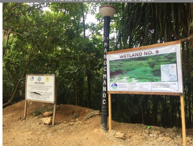
This June 2018 file photo shows Wetland No. 9 in Barangay Manoc-Manoc in Boracay

The DENR is tasked to rehabilitate the 377.68 hectares of foreign lands in coordination with stakeholders and to also supervise control of all foreign lands, water ways and alienable and disposable lands where in they are authorized to impose appropriate sanctions for any violation of applicable laws.