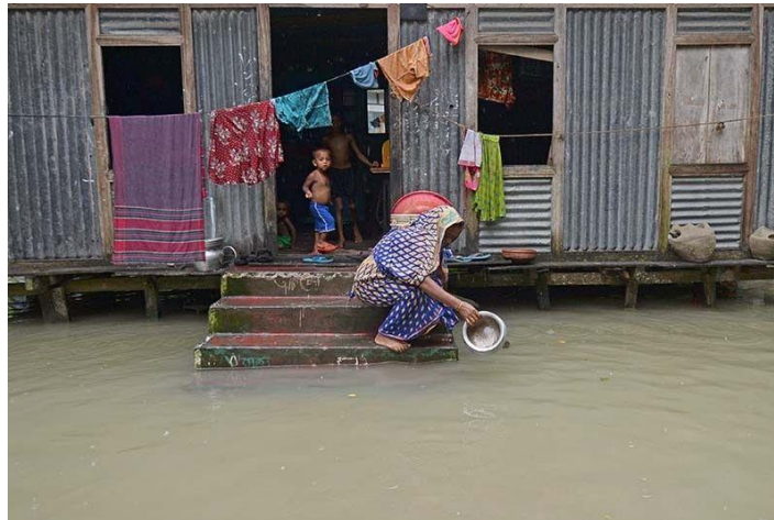
In this file photo taken on July 20, 2020 A woman washes her cooking pot in the flood waters outside her house in Sreenagar on July 20, 2020.