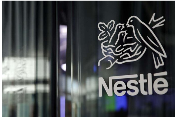
A bird's nest logo sits on display at the Nestlé SA headquarters in Vevey, Switzerland, on Wednesday, February 12, 2019.

Nestlé SA, the world's largest food company, said it will invest 3.2 billion Swiss francs ($3.6 billion) over the next five years in an effort to fight climate change.