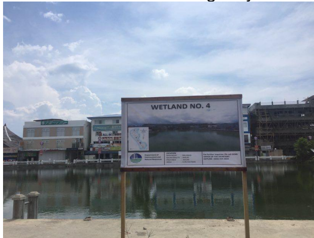
This June 2018 file photo shows Wetland No. 4 in Balabag, Boracay

Under the same EO, the DENR was also directed to relocate and demolish establishment and structures situated inside the forest lands, wetlands, and other bodies of water in violation of environmental laws or do not have licences, agreements or any appropriate tenurial instruments with the agency.