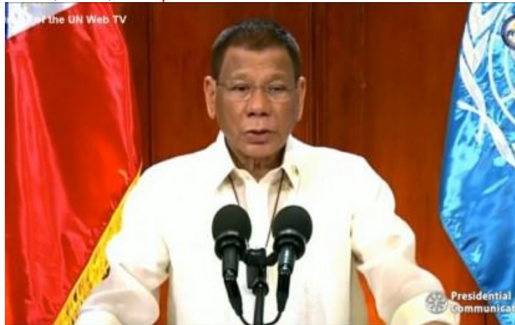
President Rodrigo Roa Duterte (File photo)

By Azer Parrocha December 3, 2020, 1:02 pm