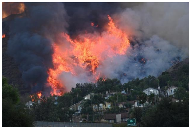
Flames are seen near homes off the 71 freeway at the Blue Ridge Fire in Chino, California on October 27, 2020.

“We must address the climate emergency, protect biodiversity, and strengthen the natural systems on which our civilization depends.”