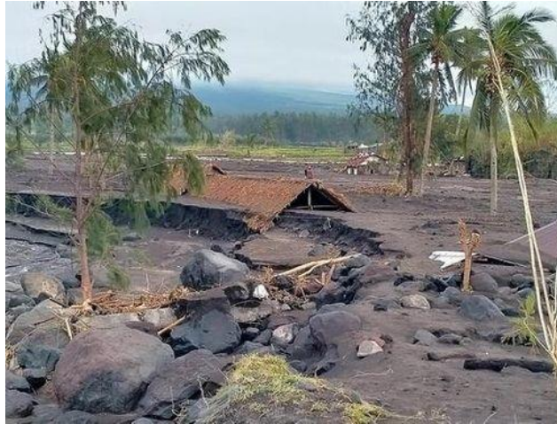
Aftermath. A house is partially submerged in debris after Typhoon Rolly swept through Daraga, Albay on Nov. 1, 2020.

The Mines and Geosciences Bureau (MGB) has recommended to the Department of Environment and Natural Resources (DENR) the lifting of the suspension of 91 quarry operators in Albay and allow them to resume operations to empty and restore the capacity of river channels around Mayon Volcano.