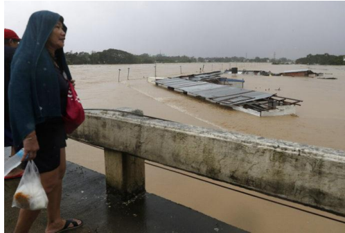
A woman looks at submerged structures at a swollen river as floods continue to rise in Marikina, Philippines due to Typhoon Ulysses in this file photo taken Nov. 12, 2020.

The Mines and Geosciences Bureau (MGB) of the Department of Environment and Natural Resources (DENR) in Region 4 (Calabarzon) has issued an order temporarily suspending certain quarry and crushing plant operations in Rizal province within the coverage of the Marikina River Basin.