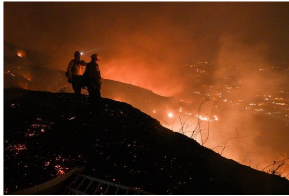
Firefighters look out over a burning hillside as they fight the Blue Ridge Fire in Yorba Linda, California, October 26, 2020.

The Lancet panel called for an “aligning of climate and pandemic recovery” to deliver near- and long-term health and economic benefits.